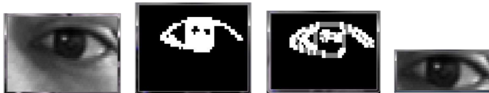
Fig. 1. Steps for extracting smaller eye regions. Left to right: Input image, p -tile thresholding, dilation result, and the final cropped eye region.