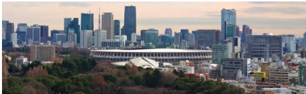
Kuma Kengo's Olympic Stadium nestles into its urban setting in downtown Tokyo. Photo: Peter Matanle, 16 January 2020.

Is there a clearer expression of the consciousness of modernity – its urge towards improvement, progress, and the individual self – than the Olympic Games? Modernity, modernism, and modernization are infused into every aspect of the Games, from the spectacular stadia, through dazzling ceremonies, to sensational athletic achievements. Amid the tendency to be analytical, and perhaps critical, let's first not forget that the Olympic Games is an immense source of inspiration, delight, entertainment, peace, idealism, and sheer unadulterated joy for millions of people around the world. And don't we all need some joy in our lives from time to time?