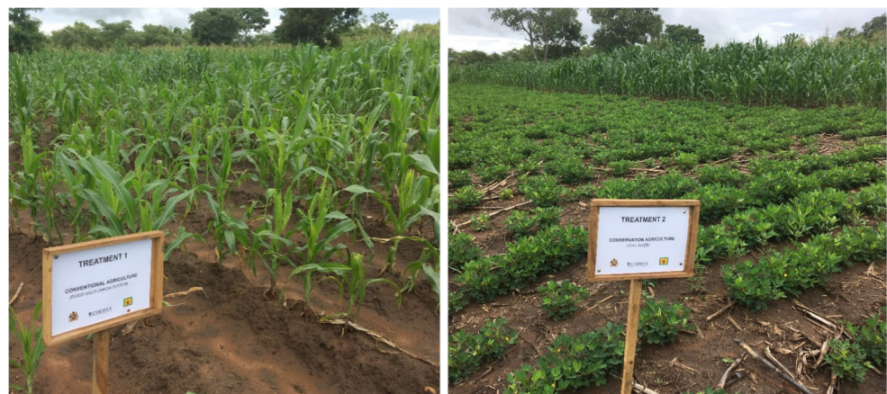
Fig. 1 Left: Malawian conventional ridge and furrow treatment without residues. Right: conservation agriculture treatment with residue cover, minimum tillage and crop rotation or intercropping. The photos of the conventional and conservation agriculture treatment were taken on CIMMYT on-farm trials in Malawi

In Malawi, the agricultural sector provides work for 80% of the working population and contributes approximately 35% of the GDP (Ngwira et al. 2012a; Tesfaye et al. 2015). Malawi is one of the southern African countries where CA has been argued to be favourable because of its low ruminant livestock density, high rural population density and challenges with soil degradation