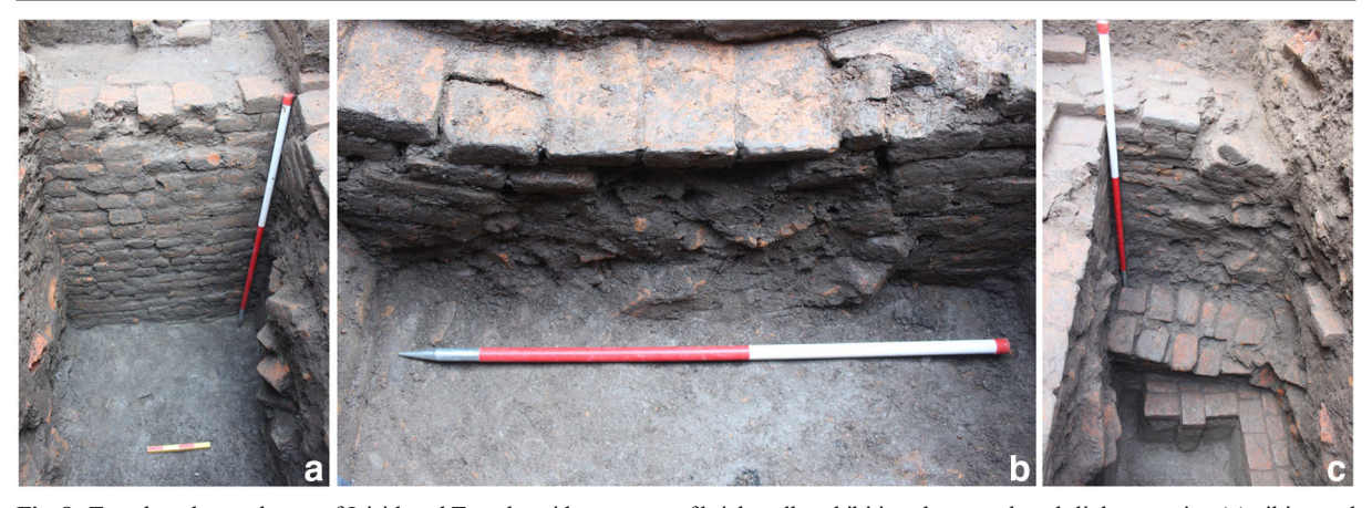
Fig. 8 Trench to the southwest of Jaisidewal Temple, with sequence of brick walls exhibiting shear crack and slight extrusion (a); tilting and collapse (b); crack and collapse of upper wall; and tilting of lower wall below (c)

identified that this had most likely occurred during conservation in the mid-twentieth century, where the rotten tenon of the large northeastern pillar was pushed into the socket below and then covered over by the tiled surface, rather than being replaced, which would have maintained the direct link between superstructure and foundations. This was likely to be a major contributing factor towards the Kasthamandap's collapse, as we found no major or catastrophic earthquake damage within the brick piers or foundations exposed during archaeological assessments, and no significant damage was reported for the monument in relation to the 1934 earthquake.