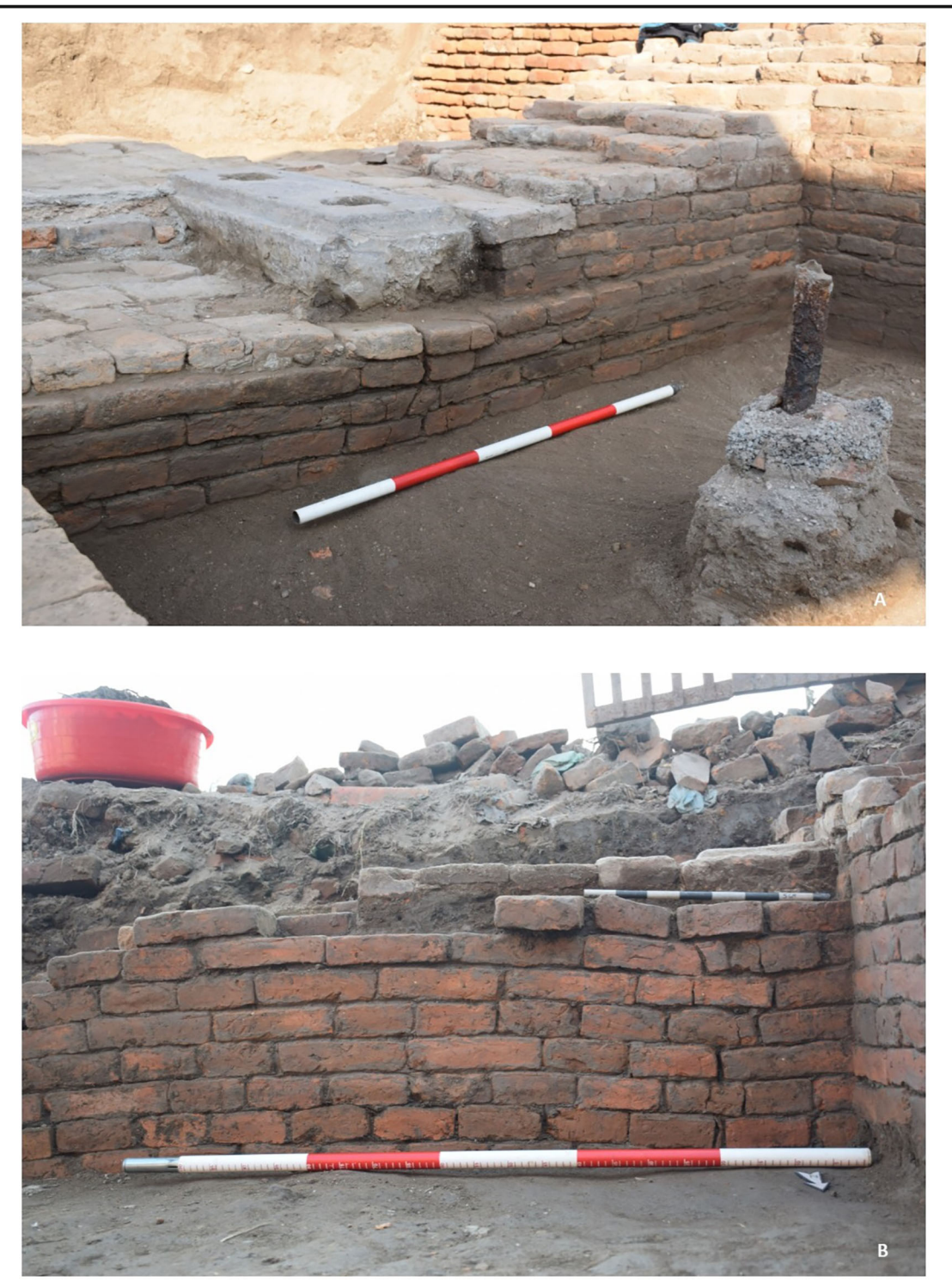
Fig. 10 Vertical cracks identified below a double saddle stone in the foundations of the Kasthamandap (a) and below a saddle stone in the foundations of the Gurujyu Sattal, Pashupati (b)

in the future, we began to co-develop archaeological approaches to assess and protect movable objects and