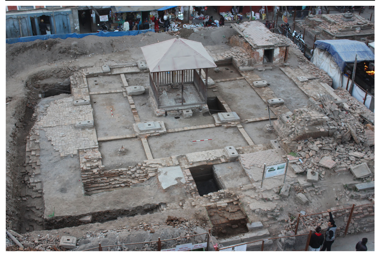
Fig. 9 Nine-celled mandala formed through brick-piers, foundation wall and cross-walls uncovered during archaeological assessments at the Kasthamandap