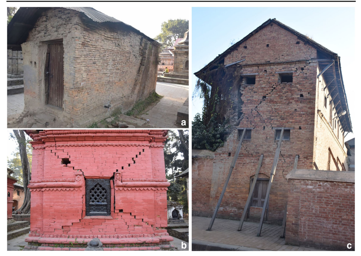
Fig. 3 Tilted wall at a structure at Mrigasthali in Pashupati (a); 'X fracture through a brick built shrine at Mrigasthali in Pashupati (b); shear cracks through one of the walls within Bhaktapur Palace Complex (c)

this being the location where architectural stresses would be higher. Extrusions and the shifting of masonry blocks was also identified, both at collapsed monuments such as the Vatsala Temple in Bhaktapur (Coningham et al. 2016b), but also within the lion statues that are located just within the western gateway of Bhaktapur's Durbar Square, which now flank the entrance to the Shree Padma Secondary High School (Fig. 4).