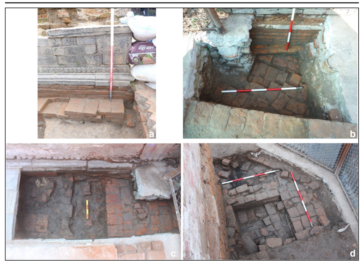
Fig. 6 The current footprint of the Vatsala Temple in Bhaktapur overlaying and overhanging an earlier brick foundation (a); a large brick wall on a differing alignment running under the plinths of the

majority suggest a date around the twelfth century CE, with it traditionally ascribed as one of the earliest standing monuments within the Kathmandu Valley (e.g. Amatya 2007: Thapa 1968: 33; Korn 2007: 128; Slusser and Vajracarya 1974: 207; Hutt 1994: 81).