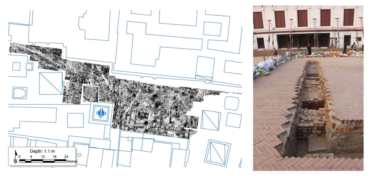
Fig. 5 GPR survey results at Bhaktapur Durbar Square at 1.1-m depth (left) and walls identified through excavation below the paved square (right)

Clearer evidence of EAEs has been uncovered in some of the excavated sequences within the Kathmandu Valley. A brick wall, thought to relate to the collapsed Lamupati,