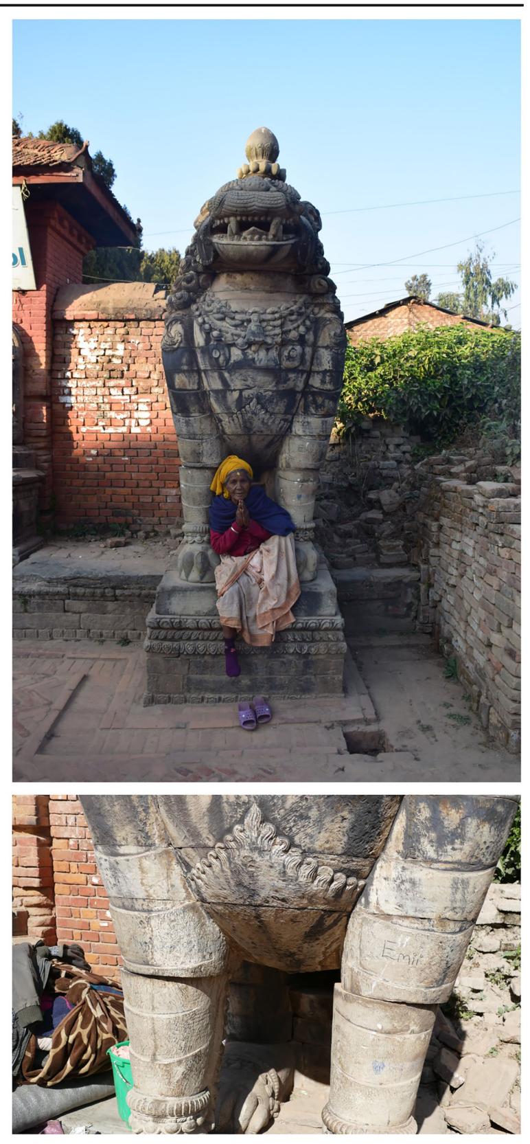
Fig. 4 Shifted and extruded stone blocks in a lion sculpture at Bhaktapur