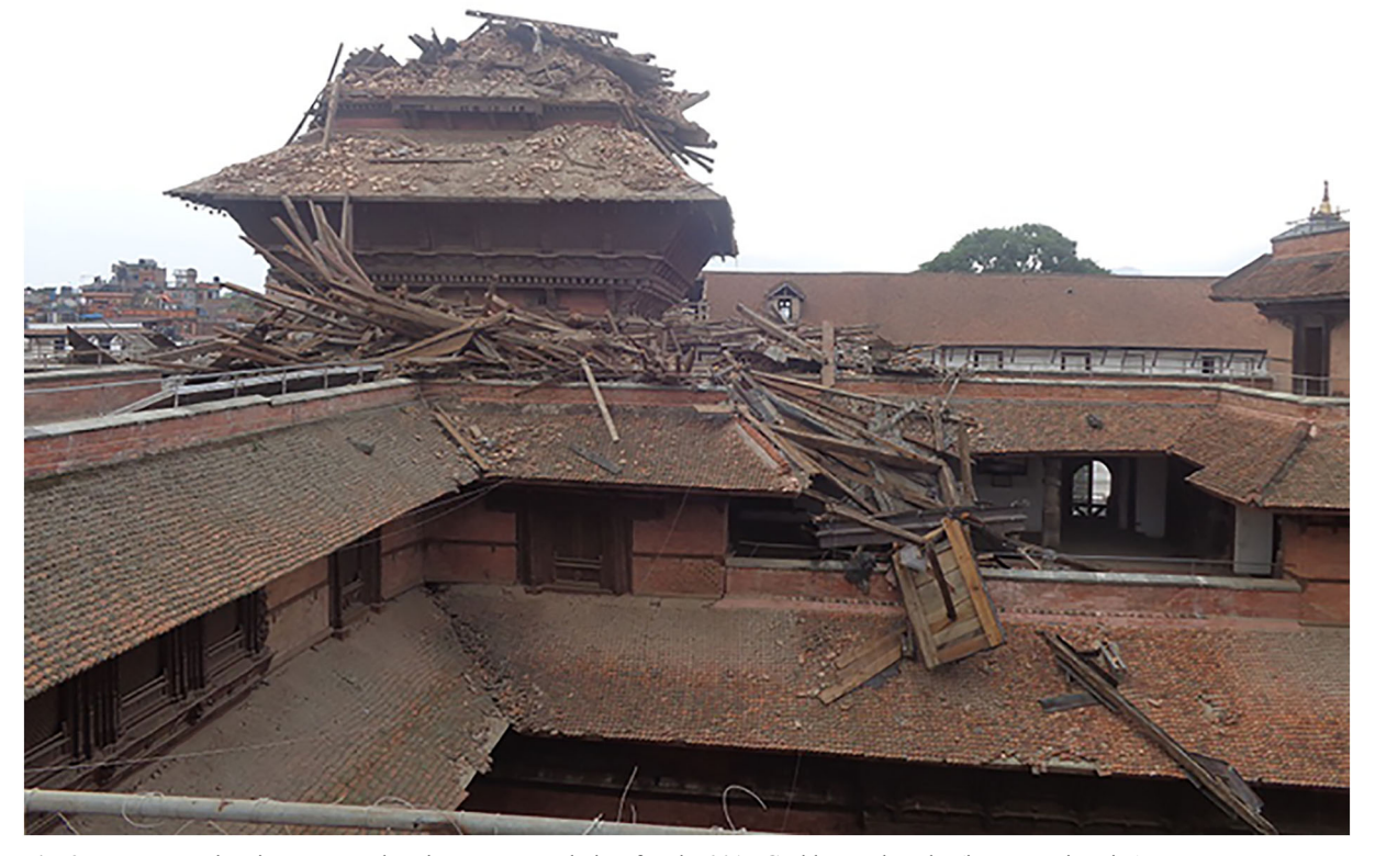
Fig. 2 Damage to the nine-storey palace in Hanuman Dhoka after the 2015 Gorkha Earthquake

developing an ancillary path for the preparation of historical seismic catalogues (Guidoboni and Ebel 2009: 418-472). On the other hand, archaeology provides extraordinary evidence for the understanding of past seismic adaptation and preparedness (e.g. Forlin and Gerrard 2017 for late medieval Europe). Frequently, the starting point for such a study is the use of textual sources to identify locations and dates of historic earthquakes. South Asia is no exception, with the vast majority of recorded earthquake events in textual sources dating from the sixteenth century onwards (Bilham 2004). However, archaeoseismological methods can also be used to identify earlier earthquakes through distinctive damage patterns within excavated sequences, as well as assessments of the fabric of historic standing remains. Such archaeological evidence can be used to identify earthquakes where no textual records are present, or in an attempt to augment the usually poor time resolution of events recorded in textual sources (Ambraseys 2006; Galadini et al. 2006; Silva et al. 2011; Sintubin 2011; Stiros and Jones 1996).