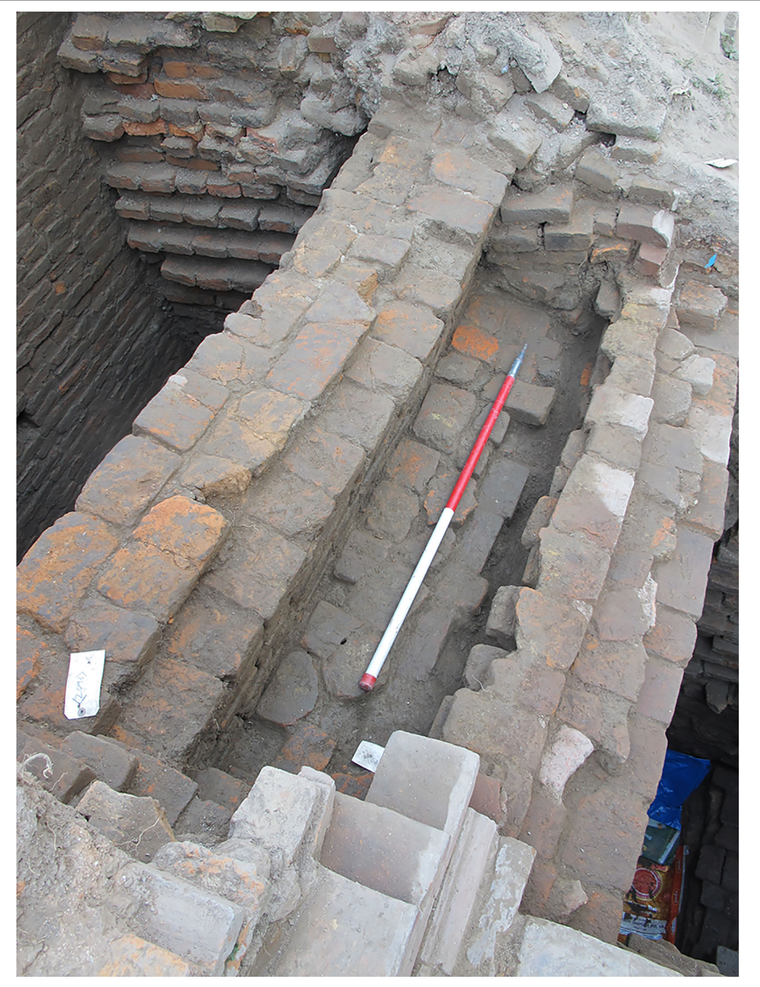
Fig. 7 Deformed and tilted wall, with later bracing, at Jaisidewal Temple

stones had traces of copper sheeting on their surface, and these may have acted as a damp course between the wooden pillar and the saddle stone, a response to the annual monsoon (Coningham et al. 2016d).