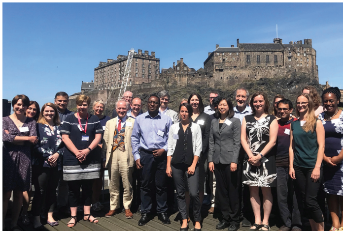
Figure 1. Members of the GHRN at the inaugural meeting in Edinburgh, 2018.

Part of the reason for this has been competing donor priorities leading to a focus on other conditions such as HIV, with a relative neglect of non-communicable lung diseases and of environmental determinants of lung disease. We hope that the launch of the UK's Global Health Respiratory Network (GHRN; Figure 1 )