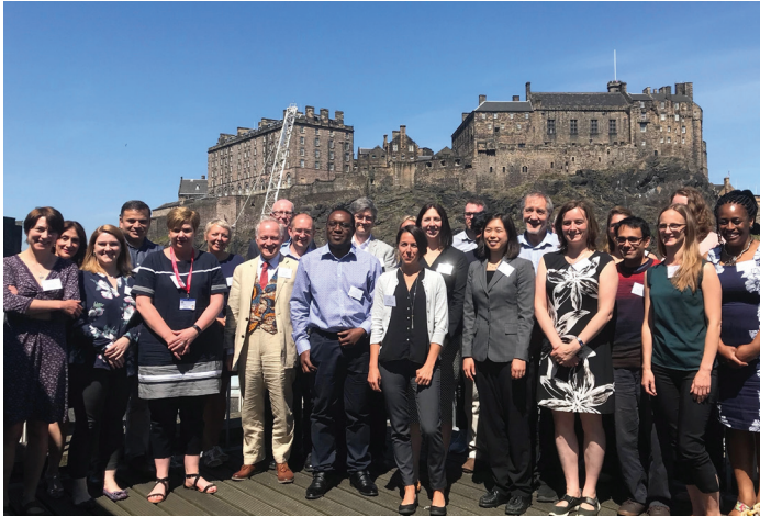
Figure 1. Members of the GHRN at the inaugural meeting in Edinburgh, 2018.

Part of the reason for this has been competing donor priorities leading to a focus on other conditions such as HIV, with a relative neglect of non-communicable lung diseases and of environmental determinants of lung disease. We hope that the launch of the UK's Global Health Respiratory Network (GHRN; Figure 1 )