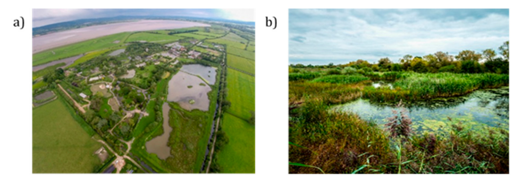
Figure 1. (a) The wetland nature-based health intervention took place within a Wildfowl & Wetlands Trust (WWT) wetland site in Gloucestershire, UK. (b) The site allows visitors to interact with wetland nature in multiple ways, including canoeing through reed beds.

area designations that cover the reserve, including at national level (Site of Special Scientific Interest), European level (a Special Protection Area) and internationally (a Ramsar site).