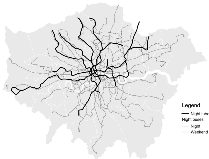
Fig. 1. Night-time transport options in London

Universalised consumers (encompassing visitors, Londoners and young people) are the most regularly mentioned subjects across all policy documents. Their mobility is described with reference to ease and speed of travel and shaped by the willingness and capacity to access to ‘all London has to offer’ at night. The description of their movements focuses on flows towards nightlife and consumption hubs, in particular in Central London’s West End (movement from home to nightlife centres, or from the airport to Central London). Their embodied experience