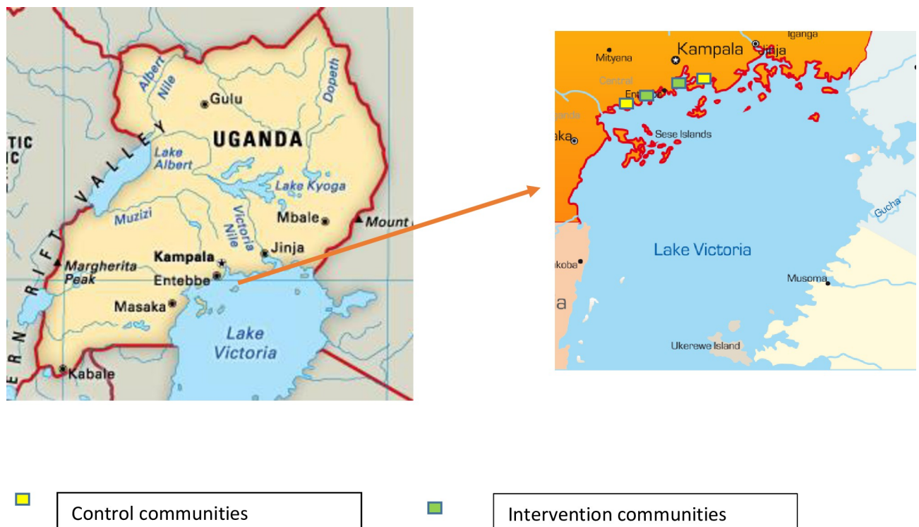
Fig 1. Map showing the intervention and control study region and communities.

From March to May 2014, we conducted a mapping exercise, and a household census of the four communities to form the individual-level sampling frame.