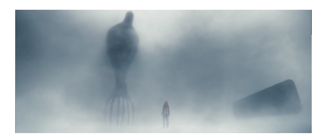
Figure 7: Arrival. Louise enters the inner sanctum