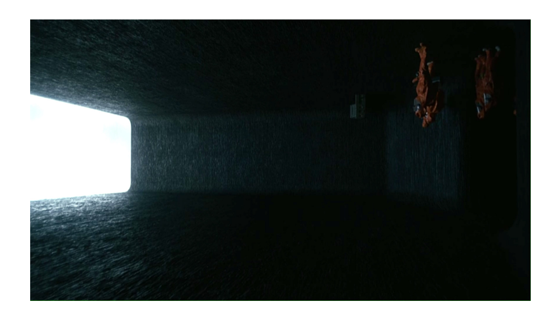
Figure 5: Arrival. A cosmic pilgrimage.

The group, whose members seem like a procession of monks, must leave the human world behind and completely lose control in order to be sufficiently elevated to meet the cosmic being (see figure 5). The imagery recalls a mystical experience: They have only a borrowed time, a window that opens in the midst of ordinary perception, and they must travel through a tunnel at the end of which awaits a luminous portal to the other world (see figure 6).