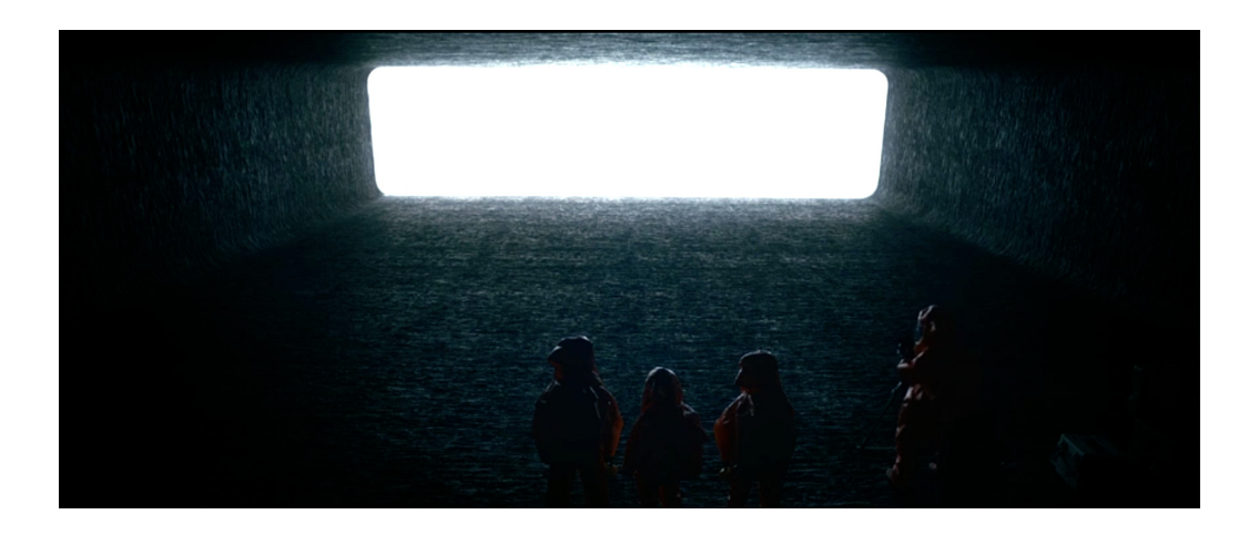
Figure 6: Arrival. Light at the end of the tunnel.

The group, whose members seem like a procession of monks, must leave the human world behind and completely lose control in order to be sufficiently elevated to meet the cosmic being (see figure 5). The imagery recalls a mystical experience: They have only a borrowed time, a window that opens in the midst of ordinary perception, and they must travel through a tunnel at the end of which awaits a luminous portal to the other world (see figure 6).