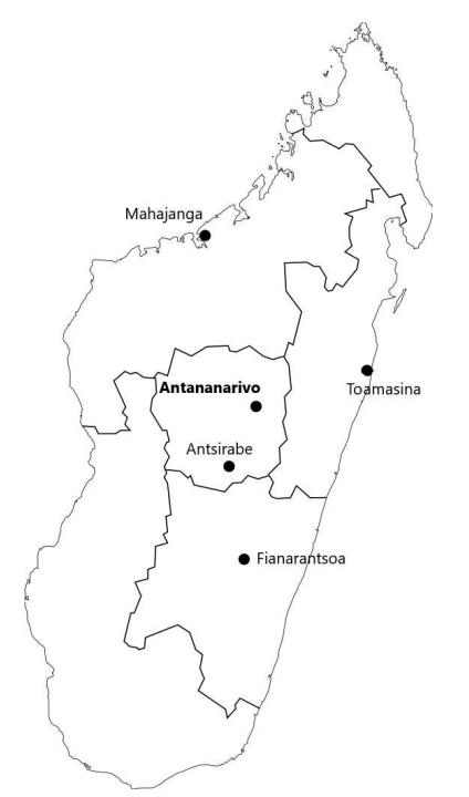
Fig. 2. Location of rehabilitation centres in Madagascar included in the evaluation (17).

Sixty semi-structured interviews were carried out (Table III) in Madagascar. Eight focus groups were also conducted; the 50 participants included rehabilitation doctors, physiotherapists and prosthetic/orthotic technicians from 6 rehabilitation centres (Fig. 2).