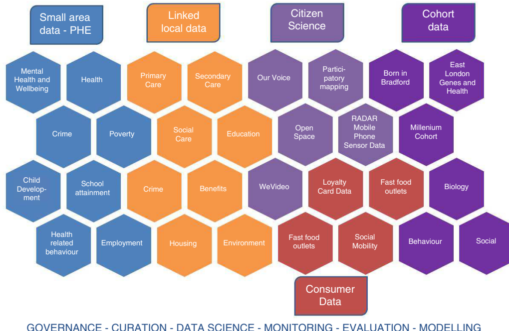
Figure 3. ActEarly data tapestry.