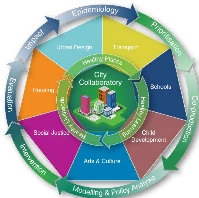
Figure 1. The City Collaboratory model utilises wide interdisciplinary expertise based in three inter-linked themes: Healthy Places, Healthy Learning and Healthy Livelihoods.

We have started our co-production activities, developing, refining and prioritizing the suite of activities outlined in each work