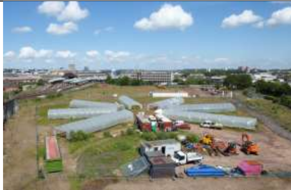
2c: The Severn Project, Former Diesel Depot Site