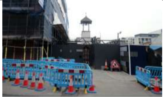
4b: Kazimier Garden in Context of Wolstenholme Square Development