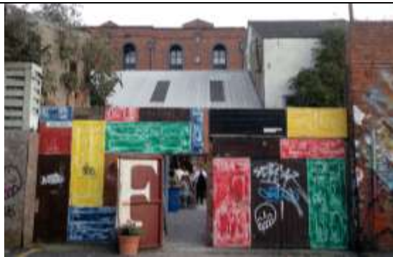
4c: The Botanical Garden, Baltic Triangle