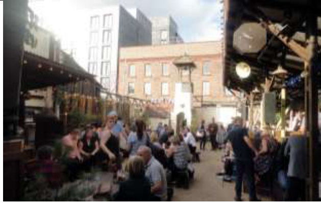
4a: Kazimier Garden, RopeWalks