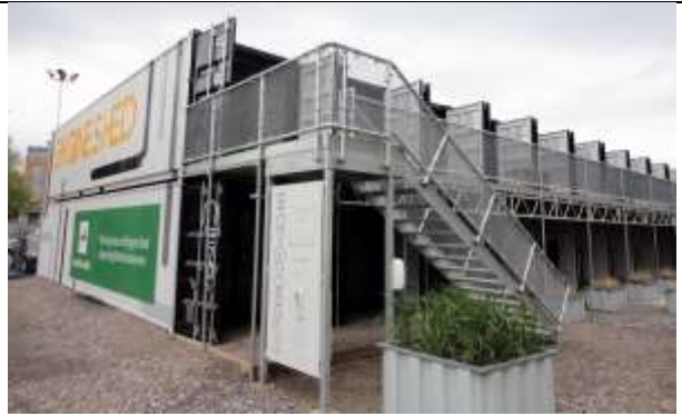
2d: Box Works, Plot 6 Temple Quay