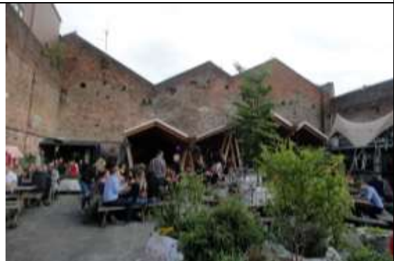
4d: Constellations, Baltic Triangle