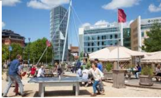
2a: Yurt Lush within Creative Common, Plot 3 Temple Quay