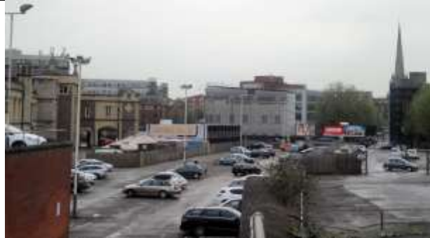
2b: Surface Car Parking, Box Works and Yurt Lush, Plot 6 Temple Quay