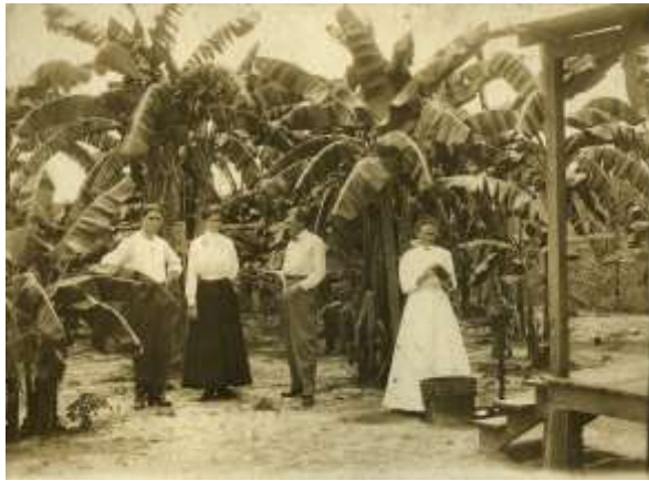
Figure 1. Plantation Owners, Trinidad, 1893