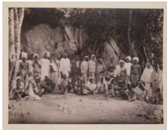
Figure 3. Indentured Indian Labourers, Trinidad, c.1890-1896