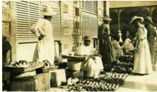
Figure 4. A Market, Port of Spain, 1910

artisan trades such as fishing, seafaring, boatbuilding, forestry and timber cutting (Higman, 1984). Similarly, Indian women developed a range of distinctive economic activities, such as the production and sale of milk, which also provided an important and alternative means of independent income (Hussain, 2012) (see Figure 6). In 1891, 68 of 71 milk sellers were Indian, and 44 were women (Census of Trinidad, 1891). The Caribbean tradition of women's independent economic activity has thus influenced the construction of their work identities, both historically and today.