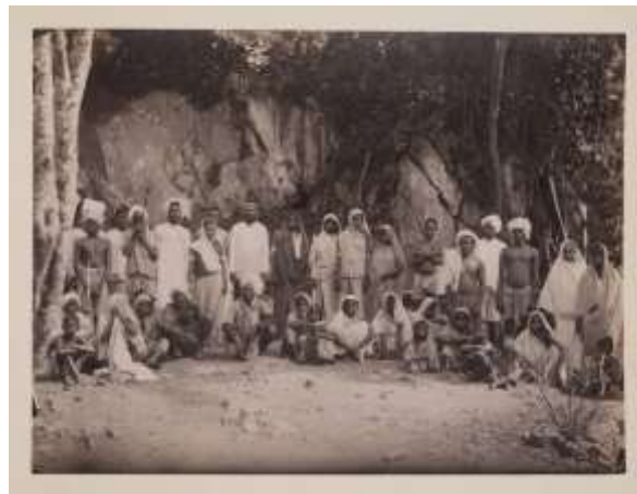
Figure 3. Indentured Indian Labourers, Trinidad, c.1890-1896