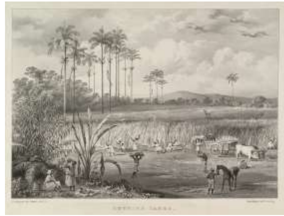
Figure 2. Cutting Sugar Cane, Trinidad, 1836