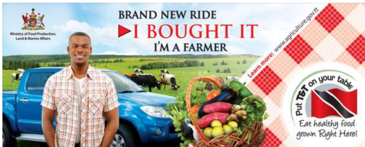
Figure 8. MFPLMA Billboard Campaign, 2012

Thirdly, the messages in the billboards speak directly to questions of ‘status’. Farming is presented as a metaphor for success and power. However, in each instance there is a disconnect between aspirational statements and reality. Figure 8 proclaims: ‘Brand new ride, I bought it, I’m a farmer’. The assemblage of messages and pictures on this billboard makes a connection between successful masculine ideals and the ability to purchase status symbols, and, in particular, a pickup truck, which is highly valued in Trinidadian society. The inclusion of a farmer with a vehicle here also references the Ministry’s Agricultural Incentive Programme (AIP). Yet it is extremely difficult to actually access these incentives. Rather than offering a loan, the programme offers 20 percent of the price of a new or used light goods vehicle, but the subsidy is only paid after the purchase, so the farmer is required to find sufficient capital to cover 100 percent of the upfront cost (MFPLMA, 2011). Many dairy farmers cannot afford to buy even a small, very old second-hand vehicle, let alone a brand-new Toyota Hilux pickup truck, which would cost approximately TT$330,000 (US$50,000).