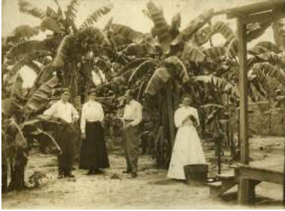
Figure 1. Plantation Owners, Trinidad, 1893