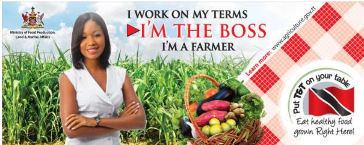
Figure 9. MFPLMA Billboard Campaign, 2012

I came across the fact that I should have been an East Indian pioneer’. 33 The billboard is, therefore, potentially only an envisioned reality for an already-wealthy farmer, most likely with additional wealth coming from other sources – ‘the gentlemen farmer’ or the ‘retired ex-Ministry official or Minister’. 34 Consequently, rather than re-envisioning farming, it could be argued that the Ministry is aspiring to attract a new strata of people towards it.