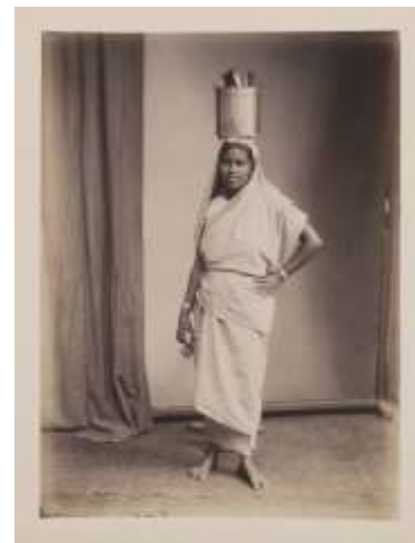
Figure 6. East Indian Milk Seller, Port of Spain, 1890

At the end of the 19 th century, women continued to make up a high proportion of the workforce, constituting nearly a third (32 percent) of those engaged in agricultural work and 44 percent of working adults. However, the highest proportion of women was found in the lowest-paid and lowest-status jobs. The most common job was 'agricultural labourer', of which they constituted 34 percent. They also made up 25 percent of estate proprietors, 23 percent of farmers, 20 percent of peasant proprietors, 8 percent of contractors and 3 percent of planters. However, high-status jobs such as 'manager' or 'overseer' were entirely male (see Table 1). A substantial proportion of those working in agriculture were also Indian. Despite only comprising around a third of the