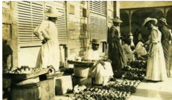
Figure 4. A Market, Port of Spain, 1910

artisan trades such as fishing, seafaring, boatbuilding, forestry and timber cutting (Higman, 1984). Similarly, Indian women developed a range of distinctive economic activities, such as the production and sale of milk, which also provided an important and alternative means of independent income (Hussain, 2012) (see Figure 6). In 1891, 68 of 71 milk sellers were Indian, and 44 were women (Census of Trinidad, 1891). The Caribbean tradition of women's independent economic activity has thus influenced the construction of their work identities, both historically and today.