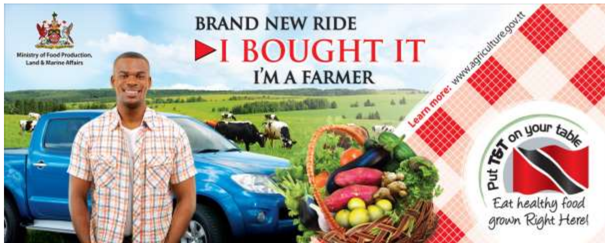
Figure 8. MFPLMA Billboard Campaign, 2012

Thirdly, the messages in the billboards speak directly to questions of ‘status’. Farming is presented as a metaphor for success and power. However, in each instance there is a disconnect between aspirational statements and reality. Figure 8 proclaims: ‘Brand new ride, I bought it, I’m a farmer’. The assemblage of messages and pictures on this billboard makes a connection between successful masculine ideals and the ability to purchase status symbols, and, in particular, a pickup truck, which is highly valued in Trinidadian society. The inclusion of a farmer with a vehicle here also references the Ministry’s Agricultural Incentive Programme (AIP). Yet it is extremely difficult to actually access these incentives. Rather than offering a loan, the programme offers 20 percent of the price of a new or used light goods vehicle, but the subsidy is only paid after the purchase, so the farmer is required to find sufficient capital to cover 100 percent of the upfront cost (MFPLMA, 2011). Many dairy farmers cannot afford to buy even a small, very old second-hand vehicle, let alone a brand-new Toyota Hilux pickup truck, which would cost approximately TT$330,000 (US$50,000).