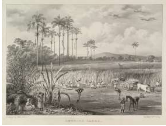
Figure 2. Cutting Sugar Cane, Trinidad, 1836