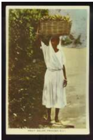
Figure 5. Fruit Seller, Trinidad, c. 1910s