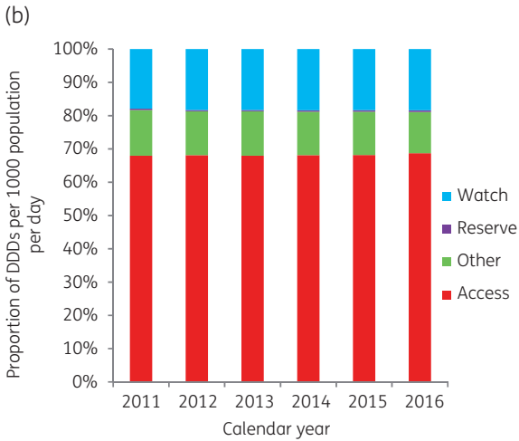
Figure 1. (a) Antibiotic consumption in England (primary and secondary care) as DDDs per 1000 population per day by WHO AWaRe category. (b) Proportion of antibiotic DDDs per 1000 population per day in England (primary and secondary care) by WHO AWaRe category. Other, antibiotics not included in the WHO AWaRe index. This figure appears in colour in the online version of JAC and in black and white in the print version of JAC .