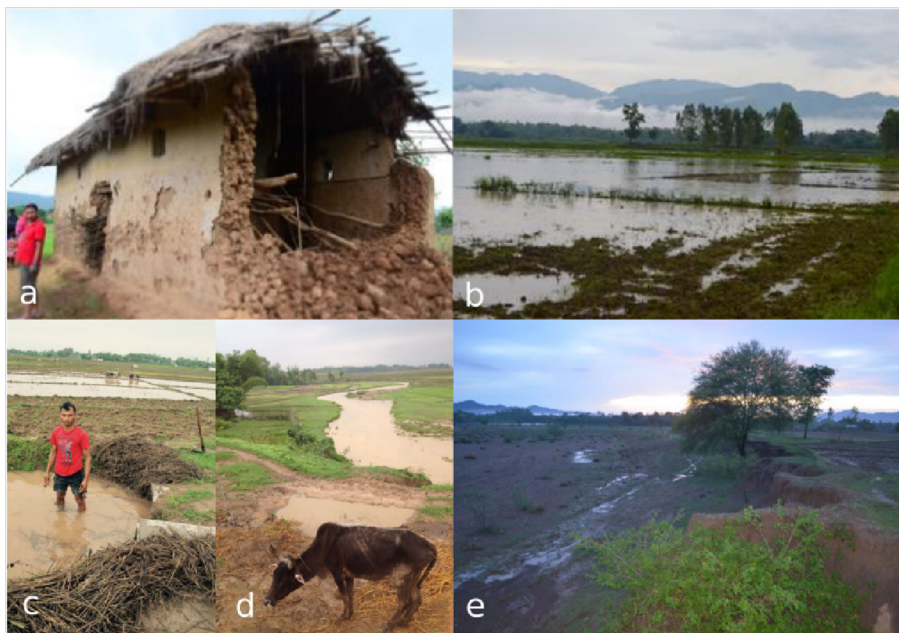
Fig. 3 Images illustrating infrastructural damage and crop sedimentation from heavy rainfall and flooding in the Terai Plains of Nepal (July/August, 2012). a Damage to a communal grain store that collapsed after heavy rainfall in Kunjiwar, Duruwa VDC, Dang Valley. b Rice fields covered in sediment adjacent to breached riverbanks of the Tinau River in Makrahar VDC, Rupandehi district. c Obstruction of irrigation canals from debris after flooding in Manikapur, Bijauri VDC, Dang. d During heavy rainfall, flooding erodes riverbanks and increases river channel depth. Here, river water covers fields where rice seedlings are cultivated, leaving the land unproductive, livestock drowned, and crops lost in Lamaai, Dang. The change in the profile of the river leads to downstream flooding. e Productive land washed away and hundreds of hectares abandoned when a tributary of the Bagaai River diverted its course in the Dang District

provide meat, milk, fertilizer, transportation, and power experience cardiac arrest, heat stress, and “drooling disease.” In both in hotter and wetter conditions, market price volatility increases, and farmers generally have to pay higher prices for inputs, thereby reducing profit margins.