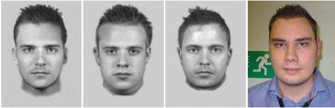
Figure 2. Example composites constructed from a holistic system of one of the targets (far right) used in the experiment. Each composite was produced by a different participant 22-26 hours after having watched a video of the target person giving directions to a local town centre. From left to right, the composite was produced without providing a description of the face (no-description), after freely recalling the face (description no-delay) and 30 minutes after free recall (description delay).