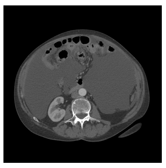
Figure 4 CT scan of the abdomen showing omental nodularity.

in those where the initial diagnosis is not clear. A history of asbestos exposure may not be present and radiological investigations may miss the diagnosis so thorough clinical assessment and a broad-thinking approach is important.