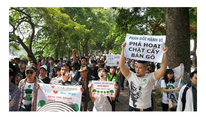
Fig. 4 Peaceful demonstration at the lake.