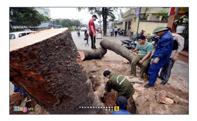
Fig. 1 Healthy old trees were chopped down. Hanoi looked like a construction site. Source http://www.doisongphapluat.com/xa-hoi/ha-noi-chat-6700-cay-xanh-gs-ngo-bao-chau-len-tieng-a87881.html