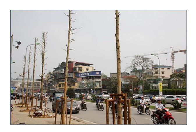
Fig. 3 Trees replanted in Nguyen Chi Thanh street after all big old trees in this street were chopped down.

fact Magnolia conifera , <sup>1</sup> a deciduous tree native to China which grows up to 30 m in height, and it is among species that are not recommended to be planted in urban streets (Thanh Nien News 2015). As quickly as within just a few days, Hanoi looked like a construction site with loads of large healthy trees being cut into logs and spread on the ground. Within a very short period of time, as many as 2000 trees which included a large number of old and valuable trees were completely cut down.