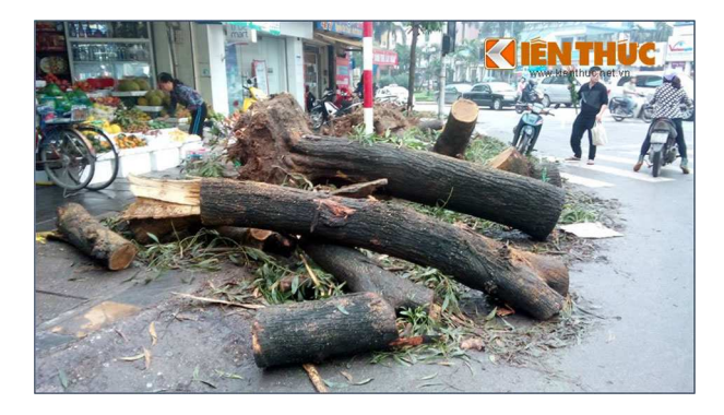
Fig. 2 Healthy old trees were chopped down. Hanoi looked like a construction site. Source http://www.kienthuc.net.vn. Available at http://www.kienthuc.net.vn/soi-xet/ha-noi-xin-khat-hang-loat-cau-hoi-vu-chat-cay-xanh-468493.html

than being chopped down. It is heart-breaking. How many years do we have to wait to have shade from trees again, which is really needed in this city where thousands of street vendors and labourers are every single day grappling with the heat in burning summers? (Interview, 18 March, 2016, Hanoi).