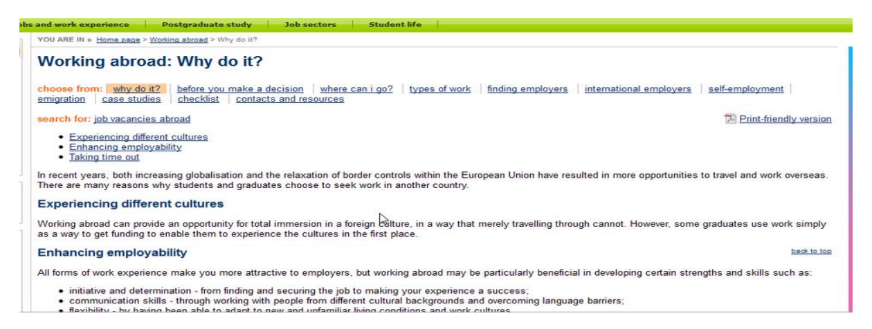
Figure 1. Kenan's Internet surfing behaviour

To provide more specifics of Kenan's behaviour, after googling studying in a foreign country pretty much immediately (9 seconds) after reading the task, he next googled why do students work abroad? in minute 8 and subsequently ended up googling working abroad: why do it? in minute 14 as the Inputlog log below shows (Figure 2).