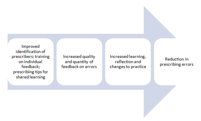
Figure 1 Logic model: basic high-level model depicting the planned inputs and intended results. 16

To facilitate prescriber identification on inpatient medication charts, we used a multifaceted approach. Junior doctors were given personalised name stamps and were reminded to write or stamp their name