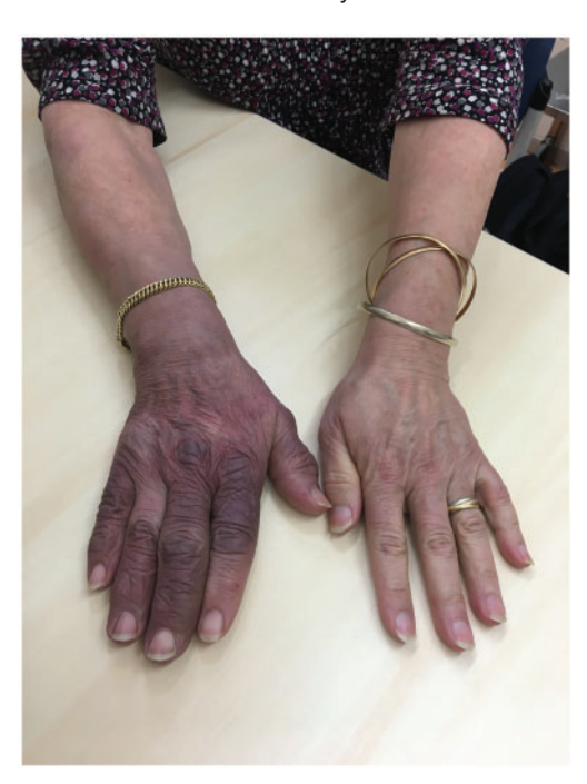
Fig. 1 Hypertrophy of the right hand with skin atrophy, red-blue discoloration and tenosynovitis