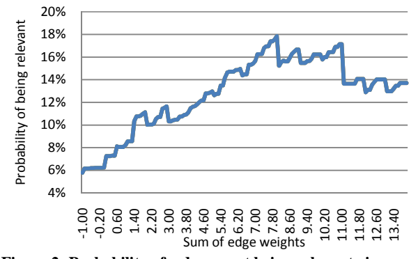
Figure 2: Probability of a document being relevant given a certain level of interaction. The y-axis represents probability that the video is relevant and the x-axis represents assigned interaction value in our graph.

We begin our analysis by looking at the average interaction value that each video had been assigned based on the user interactions. These interaction values are a sum of the edge weights leading to a particular node. We wished to see if relevant documents did in fact receive more user interaction. The average interaction value was just 1.23, with irrelevant documents having an average value of 1.13 and relevant documents having an average of 2.94. This result shows that relevant documents receive more interactions from the users of the system. Up until a certain point as the interactions from previous users increases so does the probability of the document being relevant (see Figure 2). For some of the documents with higher relevance values the probability tails off slightly. There were two main reasons that a small number of irrelevant documents had high relevance values. Firstly, there were shots that seemed relevant at first glance but upon further investigation were not relevant; participants had to interact with the shot to investigate this. Secondly, there were a number of shots that appeared in the top of the most common queries, thus increasing the chances of participants interacting with those videos.