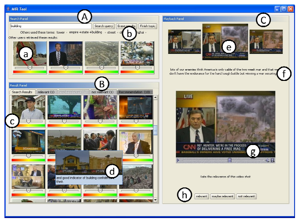
Figure 1: Interface of the video retrieval system.

In order to provide a comparison to our recommendation system, we also implemented a baseline system that provides no recommendations to users. The baseline system has previously been used for the interactive search task track at TRECVID 2006 [3]; the performance of this system was average when compared with other systems at TRECVID that year. Some additional retrieval and interface features were added to this system to improve its performance. Overall the only difference between the baseline and recommendation system is the provision of keyframe recommendations (a).