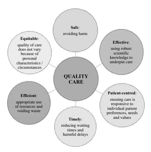
Figure 1: Dimension of quality care<sup>2</sup>

The potential benefit of patient and carer involvement in healthcare education, service delivery and research include an opportunity to influence the healthcare agenda from service developments to identifying research priorities, becoming empowering to influence change and having greater ownership of services.<sup>3</sup> In relation to healthcare delivery, a move away from a paternalistic to more inclusive approach is essential as patients, and carers as appropriate, increasingly take responsibility