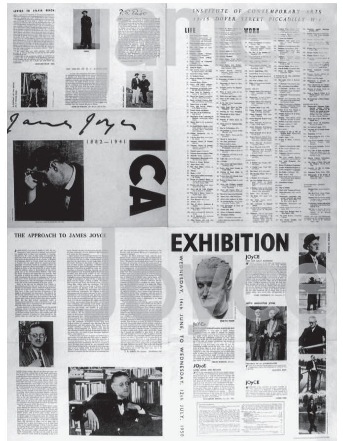
Richard Hamilton's folding poster/catalogue for the ICA exhibition James Joyce: His Life and Work , London, 1950.

Read's long-term championship of Modernism in the arts in Britain and awareness of art and politics inevitably involved him in later involvements in Joycean judgement and debate. He defended Joyce's politics, as opposed to those of Pound and Lewis, in a letter to Richard Aldington in 1926 and, as necessarily distinct from those of