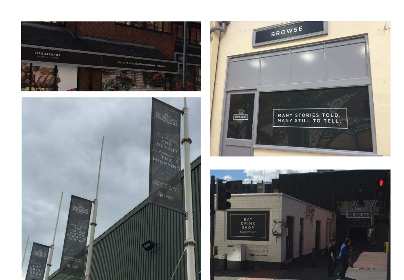
Figure 6.6 above); it is advertised as such outside the market (Figure 6.7) through a gourmetstyle wording and glamourous background aesthetics, with the overall composition recalling the image-branding of the market, including the logo, the minimalist typeface combination, and the slogan "Many stories told. Many still to tell.".