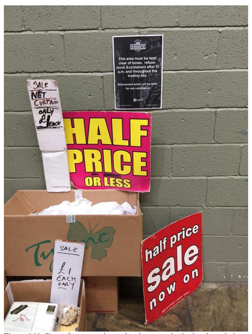
Figure 6.11. Signs of transgression and resistance to institutional regulations.

the market and the introduction of the new rule; his keeping to his practice has forced the institution to make explicit the new rule through the notice.