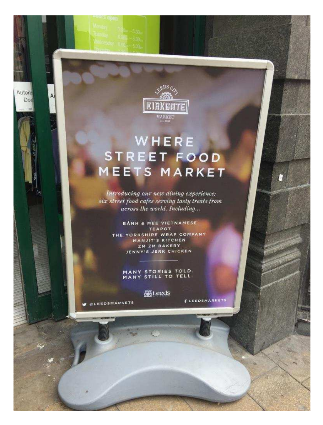
Figure 6.7. A poster outside the market advertising the renovated hall.