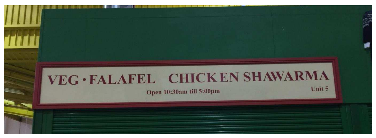
Figure 6.10. The pre- and post-hall renovation of the Veg Falafel Chicken Shawarma stall.

Along with accommodation, signs of conflict are also present, as in the case shown in