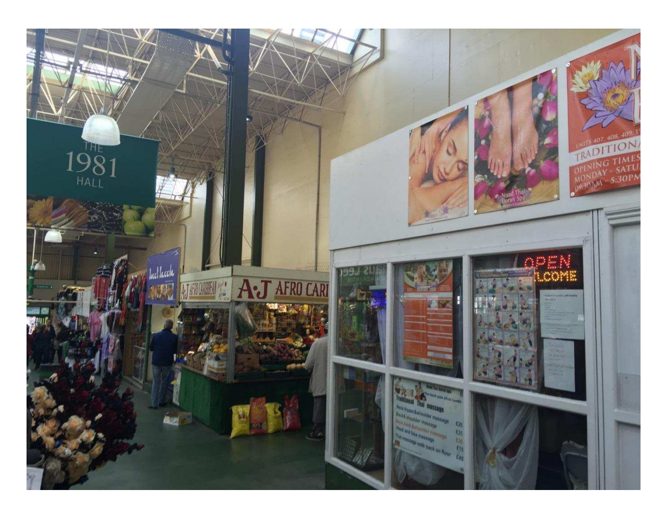
Figure 6.1. Diversity in semiotic resources in an aisle of the market.

As analysed in detail in Adami (forth.a), the most salient characteristic of the visual landscape of Kirkgate Market is the impressively wide variety of resources used in the stalls (see an example in Figure 6.1, capturing a section of an aisle of the market; see photos of all stalls in the interactive map produced by Leeds Voices at <a href="http://tour.mapsalive.com/61243/page1.htm">http://tour.mapsalive.com/61243/page1.htm</a>).