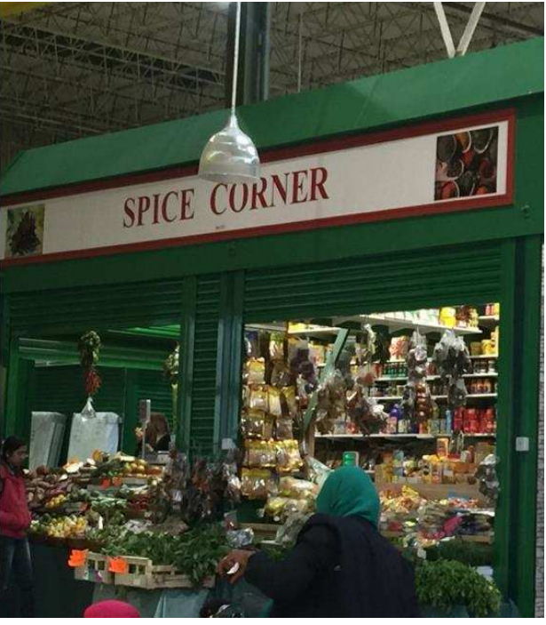
Figure 6.9. The Spice Corner in its old location (left) and after relocation (right).

A second case of changed sign-making practices is notable in the stall owned by a Kurdish couple. Their stall is at the boundaries of the new hall; while the latter was closed for renovation, the stall had a plastic banner with Arabic and English writing (top of Figure 6.10). After the hall re-opened, the stall changed the signage following regulations (bottom of Figure 6.10), with a multimodal deployment similar to that of the Spice Corner discussed above (enhancing cohesion and values of tradition in the colour, framing and serif font). In the new banner the Arabic has disappeared. To my question "aren't you using Arabic anymore?", the owner (who speaks very limited English) replied "Arabic, no!" with a face