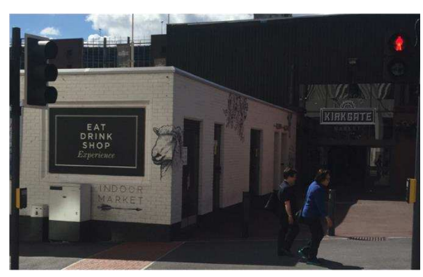
Figure 6.6. The branded image in the signage of shops outside the market (top left and bottom right), in the panels on unoccupied stalls inside (top right), and in the banners (bottom left) and entrance (bottom right, in the background).