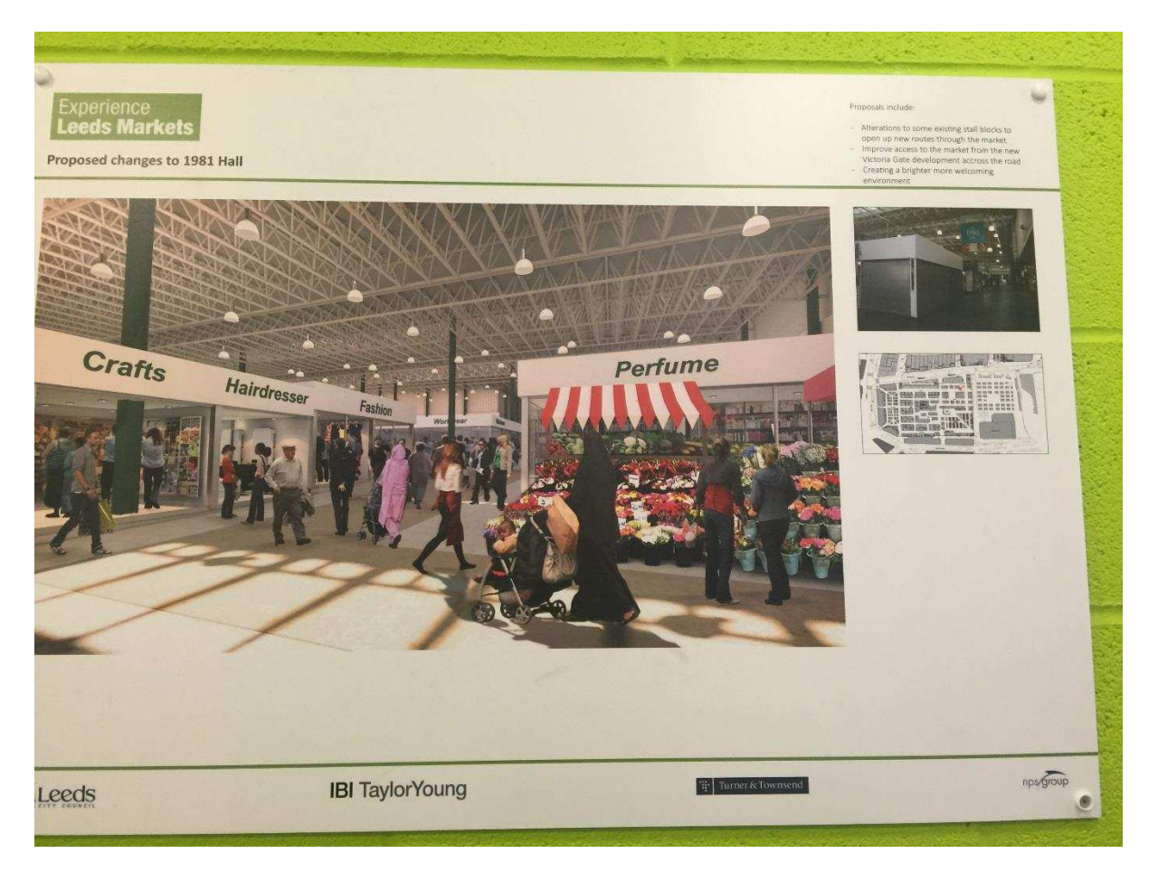
Figure 6.4 invites one to "experience" the market, thus targeting a new kind of audience, i.e., visitors in search of experiences, rather than customers coming for their daily shopping. The written text on the top right explains the rationale behind the planned changes: