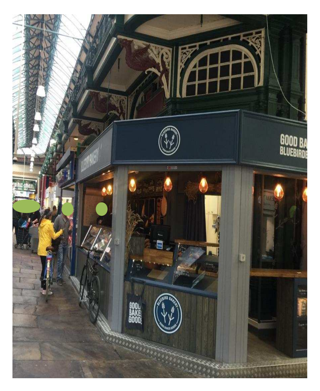
Figure 6.12. The new bakery in the Victorian hall.