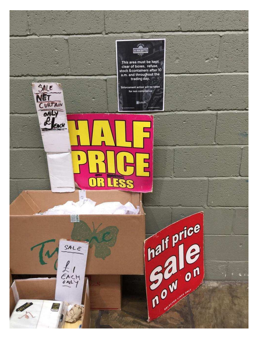
Figure 6.11, in which the positioning of the boxes of goods and their signage are clearly contravening the institution's regulation expressed in the notice (designed in the market's branded style) attached to the wall just behind them, which says,

This area must be kept clear of boxes, refuse, stock & containers after 10 a.m. and throughout the trading day. Enforcement action will be taken for non compliance