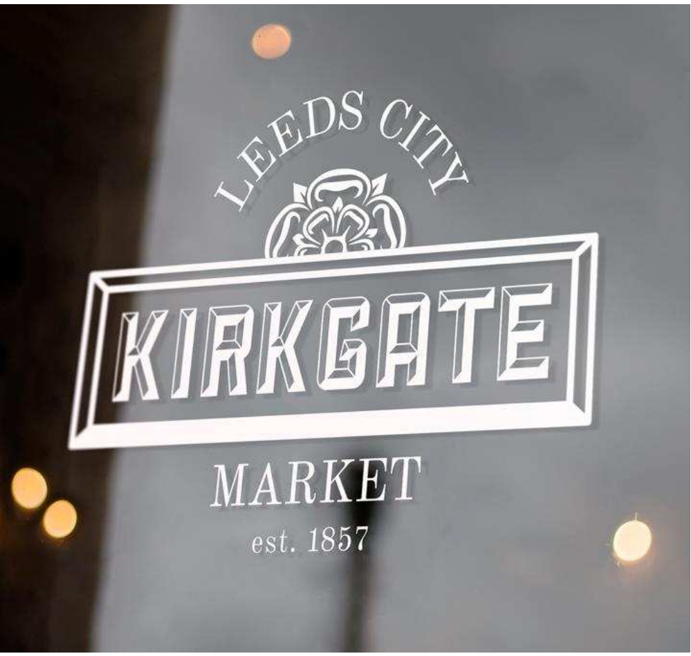
Figure 6.5. One of the main entrances before (top-left) and after renovation (top-right), and the market's new logo (bottom).