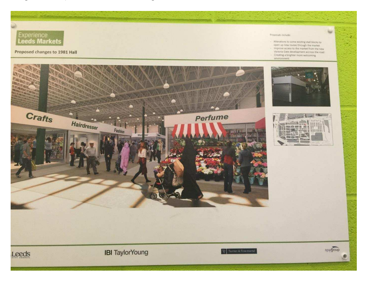
Figure 6.4 above) the authenticity of the market as a historical/traditional place, rather than use/live it as habitual customers for daily low-budget shopping needs. The placement of the logo on the entrances, and the consequent disappearance of the fruit and vegetables

The multimodal deployment of the market logo serves to identify and promote the market as a unique, traditional, and local place, through values of elegance, cohesion and minimalism, in line with current trends in distinction marketing of heritage places, which again target a specific audience. It is indeed designed to address "outsiders" and visitors, who want to "experience" (cf. the invitation in the plans in