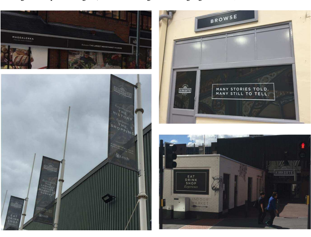
Figure 6.6 below). Layout has a main recalling function, through the positioning and orientation of "Leeds City" and "Market" that reproduce the upper shape of the entrance and its metal lettering; so, when the logo is displaced from the market entrance (i.e., when it appears elsewhere, e.g., on flyers and banners around the city, as well as on the market website), it visually recalls the place, through association of its layout with that of its main

A multimodal analysis of the logo in Figure 6.5 can single out the intended reshaping of the image of the place. In the logo, writing names the place ("Kirkgate", not present in the original entrance signage), singularises it (from "markets" to "market"), and puts a stamp of history on it ("est. 1857"). Image puts a stamp of locality/local pride, through the rose symbol of Yorkshire (the county where Leeds is). Font provides lightness and elegance, by reducing the thickness of the font body of the old "Leeds City Markets" metal lettering of the entrance, and introduces cohesion in the 3D effect of the font used for "Kirkgate" and the rectangular shape framing it (further recalling the new signage of stalls, see