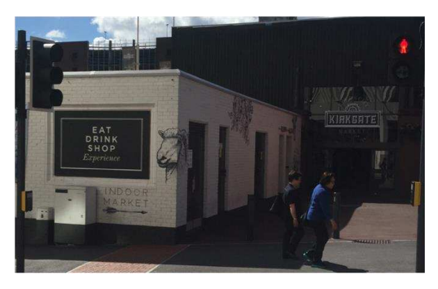
Figure 6.6), other verbs in the series are "buy", "chat", "eat", "drink", "meet", "reminisce", "share", "shop", watch". In line with the "experience" framing the renovation plan (see discussion above), besides shopping/buying, the activities triggered in the signage have semantic values of communality and conviviality ("share", "chat", "meet"), and again visiting/heritage nuances (in the "watch" and in the history and tradition implied in "reminisce"). Besides appearing individually on signage, four of the verbs appear clustered together on walls and banners, shaping a slogan: "eat drink shop experience" (bottom-right and left in