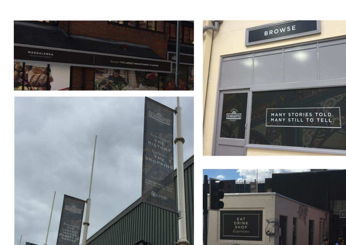
Figure 6.6). Their sequencing in the slogan is indicative of priorities: before then a space for daily shopping, the market is presented, branded and increasingly shaped (see the new hall discussed below) as a place for entertainment and food, in line with the centrality of food spaces in urban regeneration, see also (Aiello, 2013). The visual composition of the verb series, in a sans serif font, minimalist colour palette, the use of few or isolated words, and the full stop in the tagline, conforms to the characteristics of distinction signage found in Trinch and Snajdr (2017) for gentrified Brooklyn activities. In sum, the place is being branded as a landmark of the city, for those (outsiders, who align with distinction values of cohesion, elegance and minimalism) who want to experience the market's authentic, local and traditional flavour.