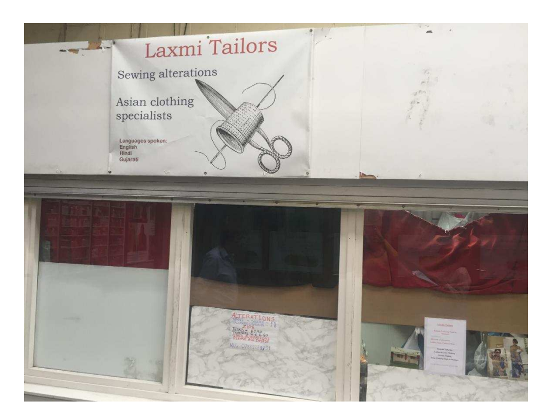
Figure 6.2. An apparently shabby design.

market may show shabbiness and neglect to our eyes; yet in-depth observation reveals the principles behind the sign-making. Economic and material reasons for the resources available combine with the sign-makers' assessment of the needs of their intended audience, as exemplified in the following two cases. In Figure 6.2, the materiality of the banner, the handwritten list of services, layered with multiple pen/marker colours and handwriting styles, the discoloured sample photos of the tailored products, the scratched surface of the wall of the stall, the un-matched materials and textiles covering the windows (with one not properly fixed), all index poverty of resources, lack of maintenance, and perhaps even sloppiness/neglect. Yet the signage lists the languages spoken in the stall and a culture-specific expertise in tailoring style, while the curtains protect the privacy of the customers inside the shop, and the poverty of resources index - the low-budget hand-made character of the service provided, all indicative of a well thought-through idea of the needs of the specific custom audience that the stall addresses.