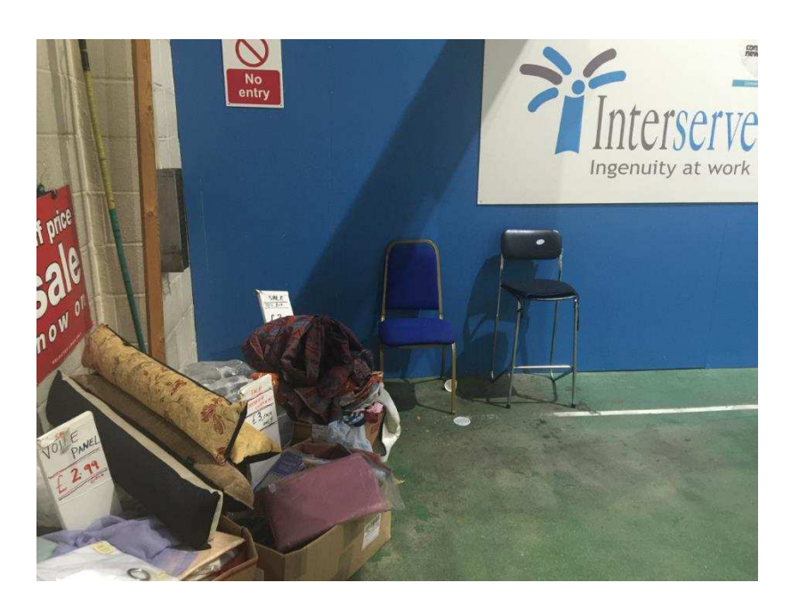
Figure 6.3. Transgressive layout and chairs as neglect vs. welcoming signs.

Rather than careless or 'accidental', vernacular sign-making in the market is principled; yet the social and semiotic principles on which it hinges may differ from those of professional design, because sign-makers' interests differ, as in the example shown in Figure 6.3. The layout seems to index -"transgression" (Scollon & Wong Scollon, 2003), with the boxes of objects on sale placed outside the boundaries of the stall. Yet the transgressive sign is the result of a conscious choice, rather than what could appear to be carelessness (stall holders must pay for space they occupy outside the stall). From an interview with the trader of the goods displayed in Figure 6.3 (a man in his 50s, originally from India), it emerged that he places the two chairs opposite his stall to offer a place to sit to the many (often elderly) habitual visitors who come to the market not only to shop but also to socialise and spend part of their day, given the absence of seats not designated for consumption. To an eye influenced by mainstream aesthetic tenets (like mine), the materiality and design of the two chairs and their juxtaposition with the boxes in Figure 6.3 would be interpreted as signs of neglect or shabbiness. Instead, as emerged in the trader's interview, they are meant as signs of welcoming and caring, and are interpreted as such by the people who often sit there.