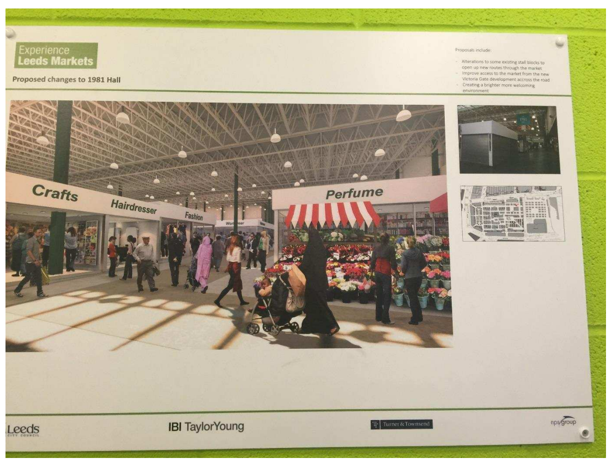
Figure 6.4. Renovation plan.