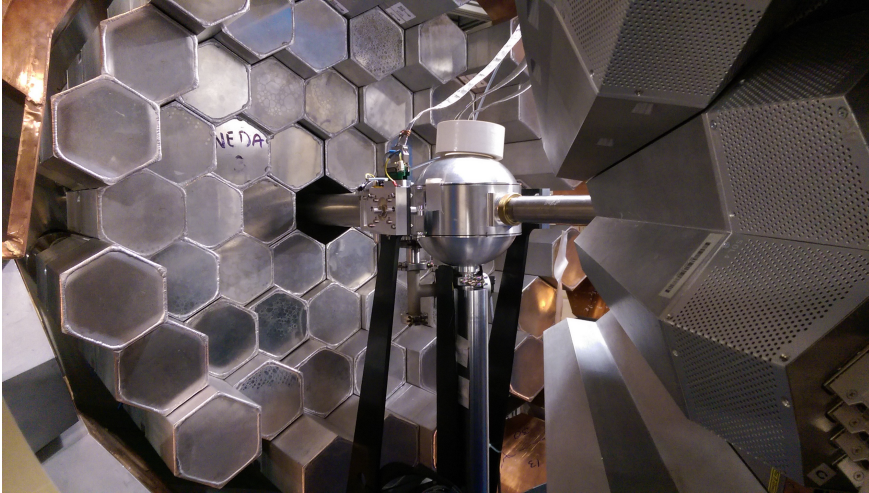
Fig. 2. From right to left (the beam direction): AGATA clusters, ion guide, target chamber with DIAMANT inside, NEDA array. Two triple Neutron Wall detectors are visible in the lower left corner.

of the accelerator, trigger generation, clocking, data packaging and readout. The coupling of NEDA electronics with other detector systems (AGATA and DIAMANT) was done employing the Global Trigger and Synchronisation (GTS) system [20], working with a 100 MHz clock.