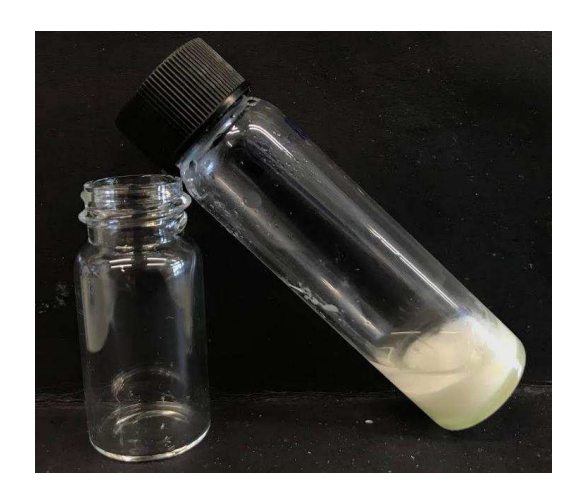
Figure S2. Digital image of an unsuccessful PISA synthesis conducted at pH 3. The target diblock copolymer composition was PNMEP<sub>42</sub>-PHPMA<sub>200</sub>.Macrosscopic precipitation is evident for this PISA formulation.