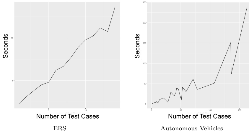
Fig. 4 Number of Test Cases versus Execution Time