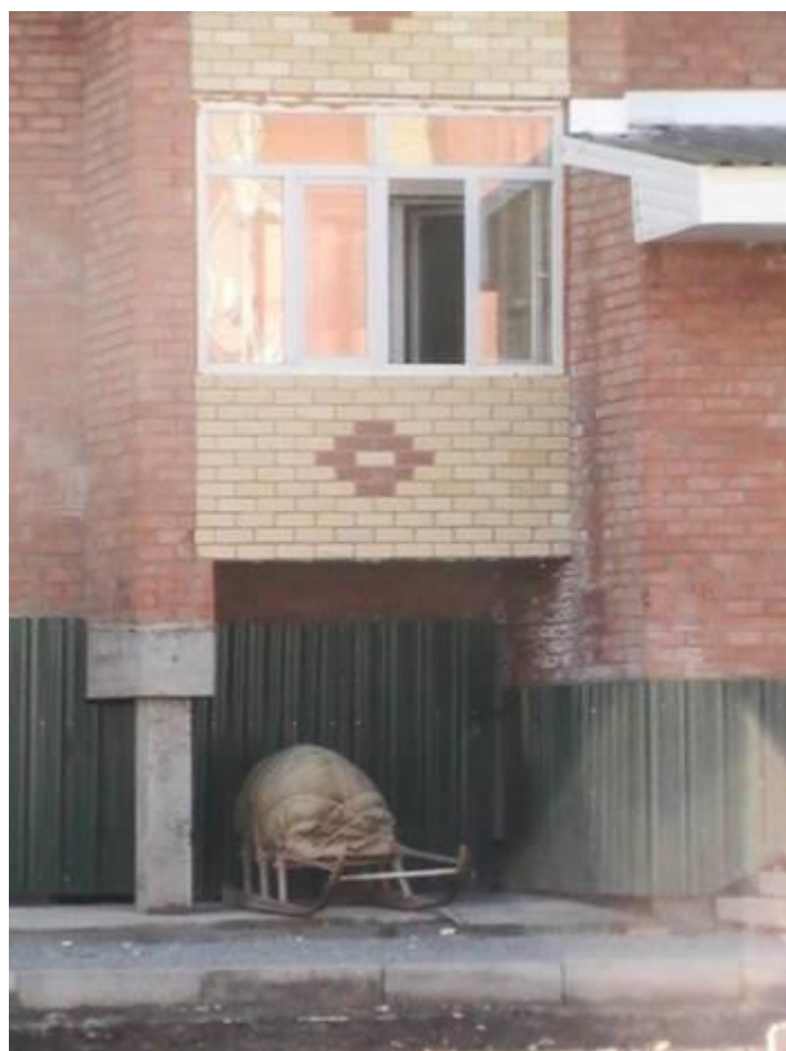
Figure 3: Sedentary life in the settlement

“This might mean the end of reindeer herding which, in turn, might lead to the fact that about 300 Nenets families will have to settle down. They will live in Yar-Sale or somewhere else and will start fishing” (R17).