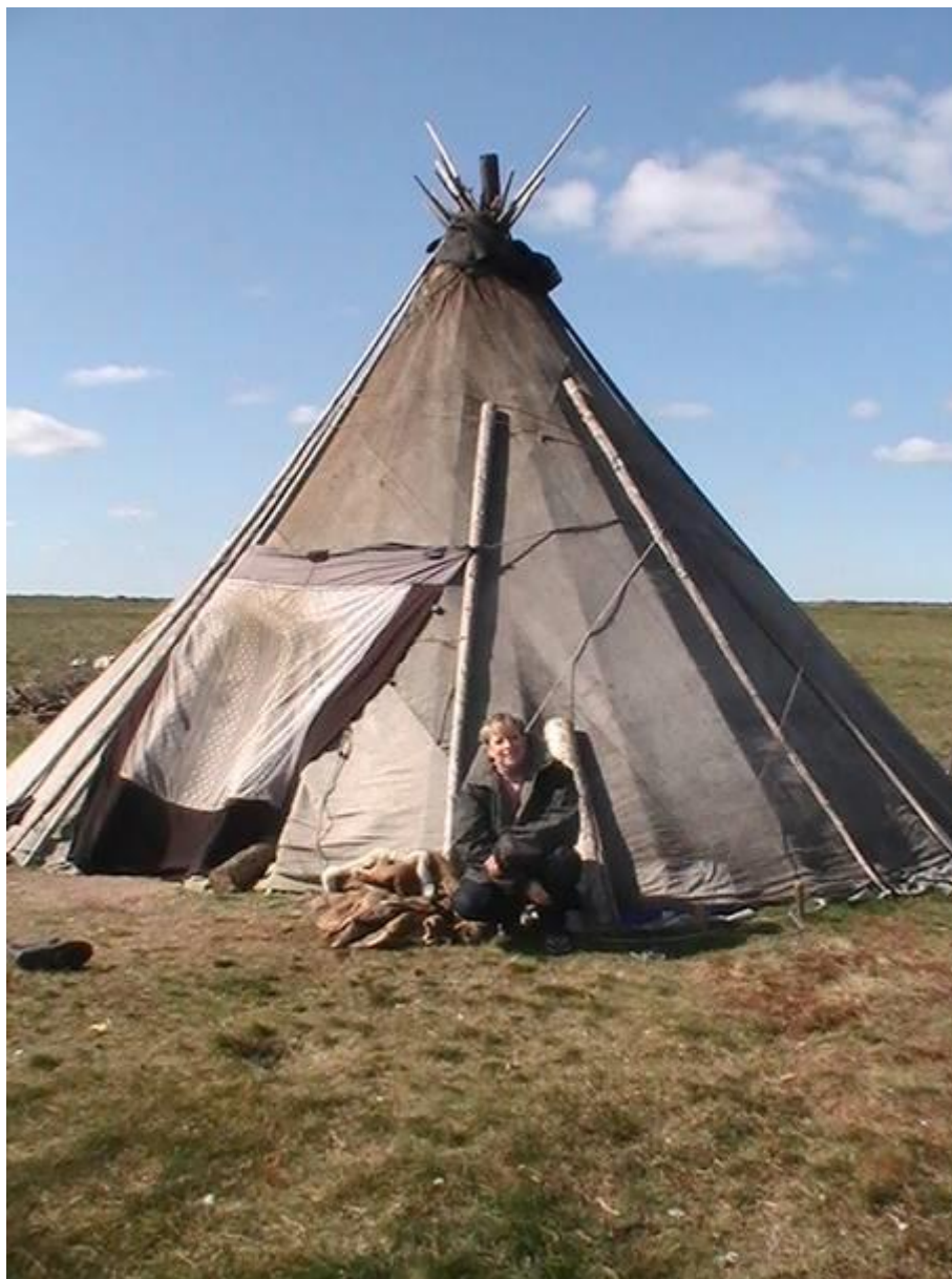
Figure 4: “The Nenets” participation in inbound tourism industry development

inbound tourism industry development (Figure 4). Here, the process of reoccupation illustrates Gaventa's notion of claimed/created spaces.