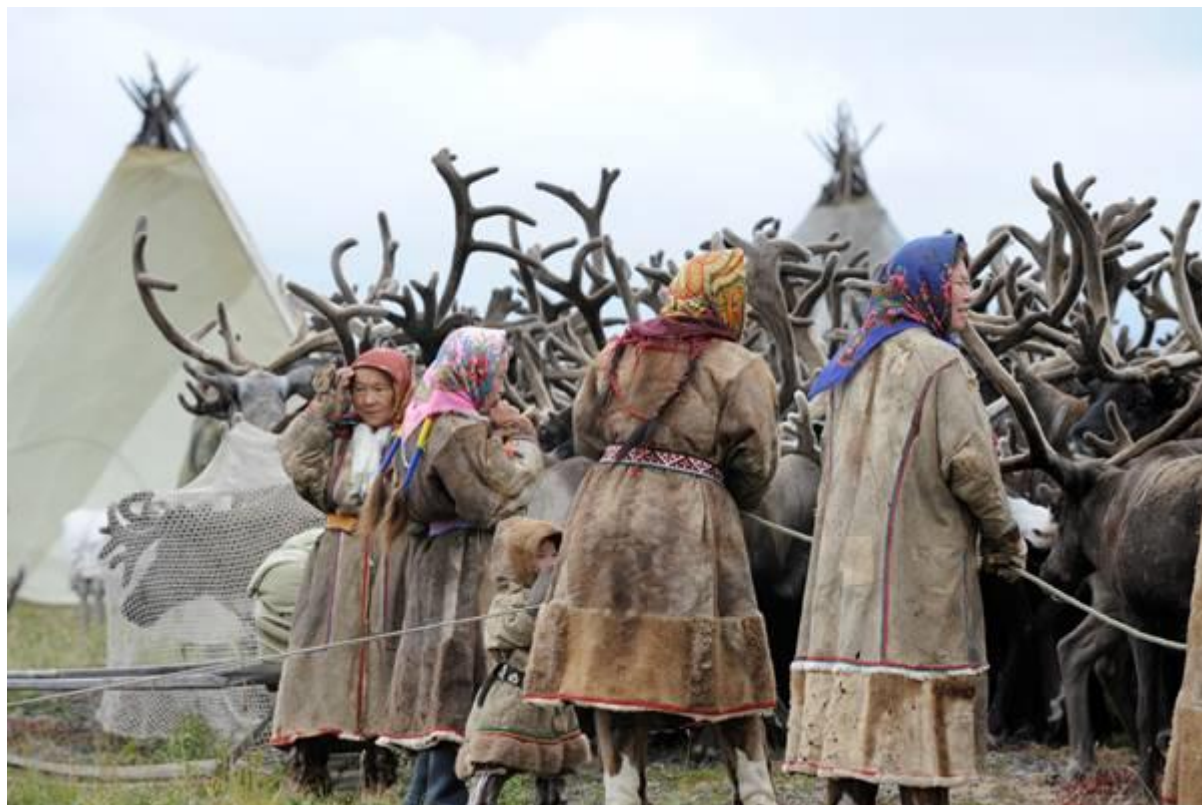
Figure 2: Shortage of space for the “Nenets” reindeer herders

are managed in increasingly smaller spaces through pasture reduction therefore dissimilarities in the ‘representations of space’ between the representatives from “the Nenets” and local government can be seen. These are based on competing understandings, meanings and values as well practices invested in the use and appropriation of space.