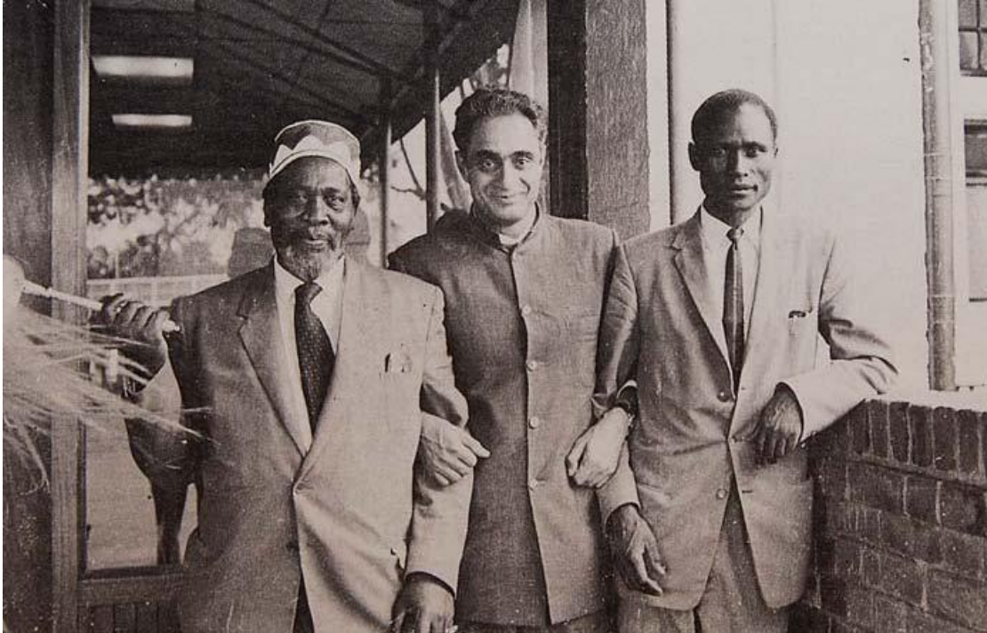
Figure 1: Apa Pant (center) with Kenyan nationalists Jomo Kenyatta (left) and Achieng Oneko (right)

Before his assassination in 1964, the alleged result of his socialist radicalism and association with President Kenyatta's political rivals, Pinto played key strategic roles in KAU and independent Kenya's first ruling party, KANU. He established KANU's newspaper Sauti ya Africa through his 'Pan-African Press', born in part with finance from Pant. Pinto was Pant's passport to Kenya's anti-colonial leadership and fixer for Kenyan nationalists in search of Indian allies and resources.