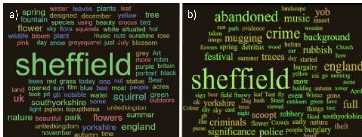
a) greenspace with positive sentiment