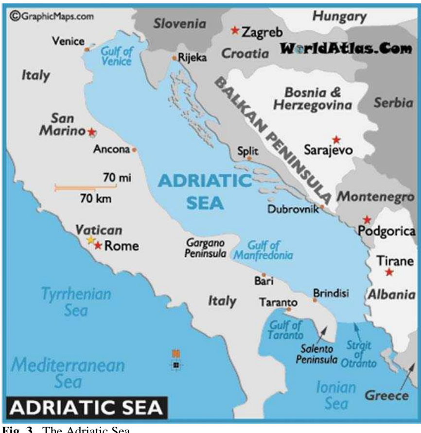
Fig. 3 The Adriatic Sea (http://www.worldatlas.com/aatlas/infopage/adracsea.gif)

of between 93 and 248 km, and a coastline of 3,707 km (6,200 km with the addition of all the approximately 1,300 islands, mostly along the eastern shores of the Adriatic) [31]. There are six states with a coastline on the Adriatic – Italy in the west, with a coastline of 1,249 km, and (from north to south on the Balkan Peninsula), Slovenia (coastline of 47 km), Croatia (1,777 km), Bosnia and Herzegovina (23 km), Montenegro (298 km), and Albania (362 km) in the east (see Figure 3 ) [31].