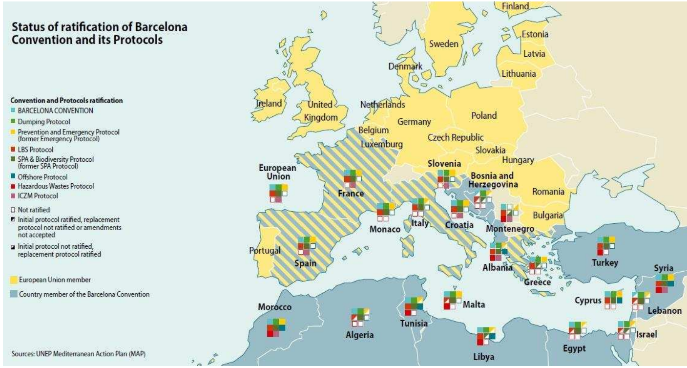
Figure 2: Map showing Status of Ratification of the Barcelona Convention and its Protocols . Source: GRID Arendal. Available at: <u>https://www.grida.no/resources/5911</u>