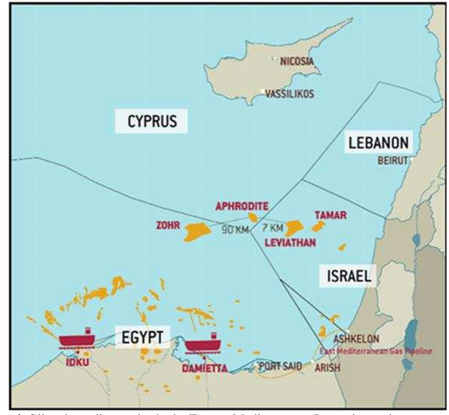
Fig. 4 Oil and gas discoveries in the Eastern Mediterranean Levantine region (International Institute for Strategic Studies) [40]

An NCP for oil spill response was developed by Cyprus in 1987, and subsequently reviewed in 1997 and 2013. As with other NCPs in the Mediterranean, in the event of a major incident an Emergency Response Centre will be established to coordinate any spill response, including co-operation at sub-regional level if required [22]. Cyprus has, as noted previously, a sub-regional agreement with Israel and Egypt to combat oil spills, and is developing a trilateral agreement with Greece and Israel [21]. Out of seven marine accidents recorded in Cyprus waters (according to the REMPEC Accident database 2004-2014), only two resulted in very small amounts of oil being spilled at sea [22]. A wide range of anti-pollution equipment and materials are available for use in the event of a pollution incident, including dispersants, booms, skimmers, and spraying units, stockpiled at various locations on the island [22]. While the Republic of Cyprus does not own any antipollution vessels, it does have access to them with the Department of Merchant Shipping being responsible for liaising with EMSA to contract oil recovery services including use of EMSA oil spill response vessels located around the Medi-