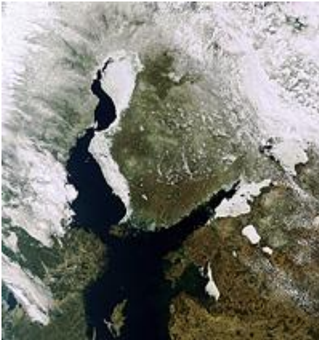
Figure 2 – ENVISAT image of Baltic ice coverage, April 2011

ENVISAT image of 19 April 2011 ice coverage in the Baltic Sea. ESA Multimedia Gallery ID number: 231435.