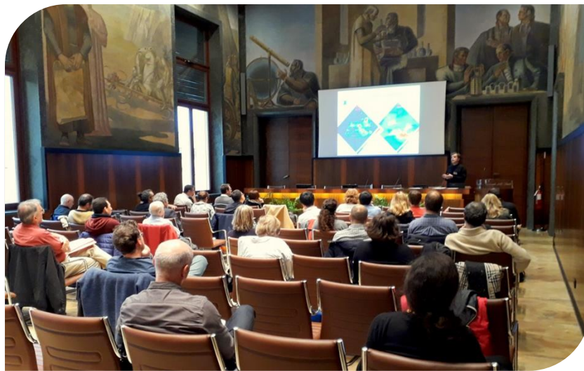
Figure 1: Presentation in the plenary room at the Italian National Research Council.

dealt with “Interactions between aerosols, clouds and marine ecosystems in contrasting environments”.