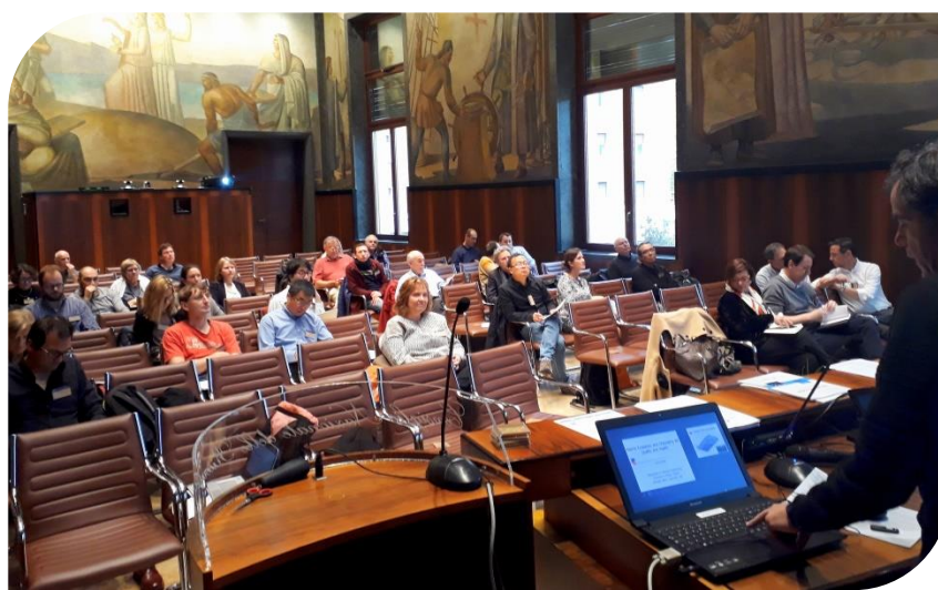
Figure 2: Plenary presentation of Spyros Pandis.

scarcely characterised. For instance, the exchange of particles, toxins, pollutants (including newly developed materials, such as engineered nano-particles and graphene) are scarcely understood in general and in the coastal context in particular. Moreover, the role of the sea surface microlayer in this process has been pointed out as potentially important and warrants more detailed investigations. The second research area addresses the forcing and feedbacks between the sea and the atmosphere in the coastal environment. The importance of non-linear interactions between water biology, water and air composition, meteorology, human health, ecosys-