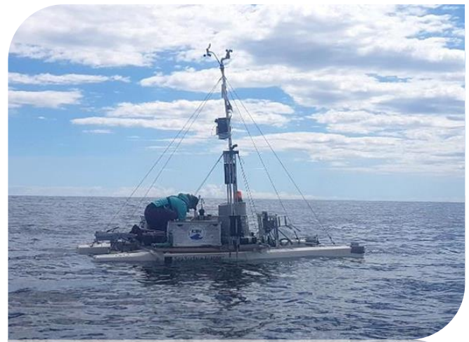
Figure 9: Our Catamaran "Sea Surface Scanner" which can collect in situ data on the SML and ULW at 1 m and can collect discreet water samples. Featured being deployed in the Baltic Sea.

We use a catamaran (Figure 9) for in situ measurements of the sea surface microlayer and underlying water at 1 m (Ribas-Ribas et al. 2017).