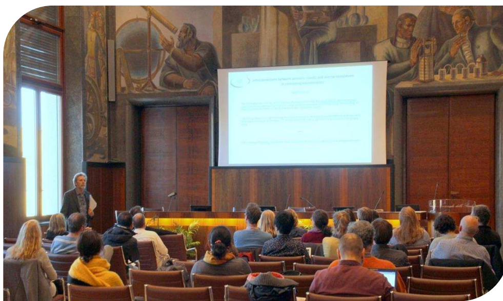
Figure 4: Maurice Levasseur is providing a short overview of SOLAS. © Jessica Gier