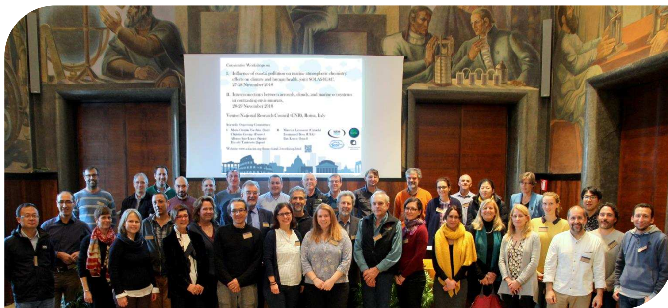
Figure 3: Joint group picture of the workshops participants.

The outcomes of the workshop contribute to advance our knowledge of the Core Theme 5 "Ocean biogeochemical controls on atmospheric chemistry" of the SOLAS 2015-2025 Science Plan and Organisation.