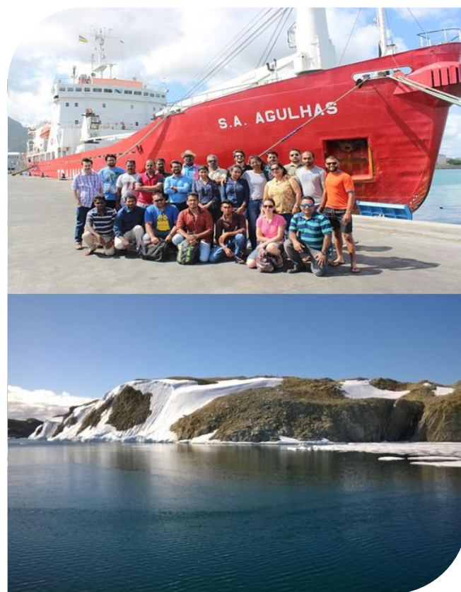
Figure 8: Images of the Indian Southern Ocean Expedition in January - March 2017 to sample the Indian and Southern Ocean from Mauritius to Prydz Bay (Antarctica).

samples of the surface microlayer. These results underline the importance of DOC in air-sea gas exchanges. Our observations will be used to refine the I_2 flux model proposed in Carpenter et al. , 2013.