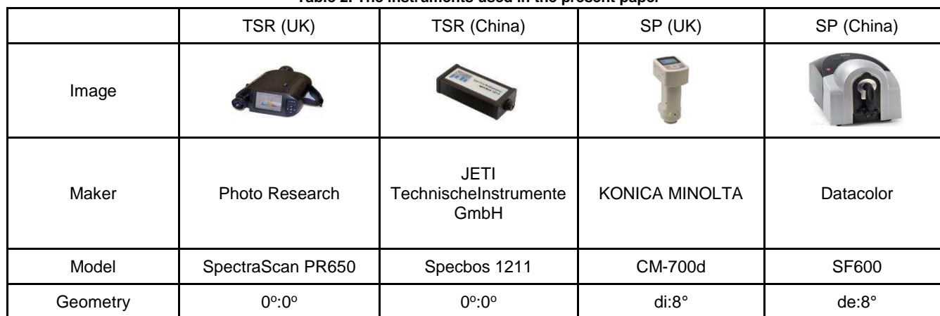
Table 2. The instruments used in the present paper

For measuring skin colours using TSRs, the illumination conditions were quite different. Figure 1 shows the skin capturing conditions between the two sites. In UK, to achieve uniform lighting, a lighting cabinet was specially built, which was painted with a mid-grey matte colour inside and was illuminated by a D65 fluorescent simulator offering evenly diffused illumination. The PR650 TSR was located in the aperture in front of the subject. The measurement angle was fixed to 0°, and the measurement distance was 57 cm. In the Chinese experiment, a luminaire, the same fluorescent D65 simulator as the one in UK was hang on the ceiling, with a distance at about 1 metre and the measurement distance was about 1metre as well. The UK setup had a more uniform illumination than that in China.