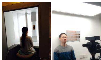
a) U.K. condition b) China condition

Their measurement results were arranged in terms of spectral reflectance. These were then transformed to CIELAB coordinates under D65/10° condition.