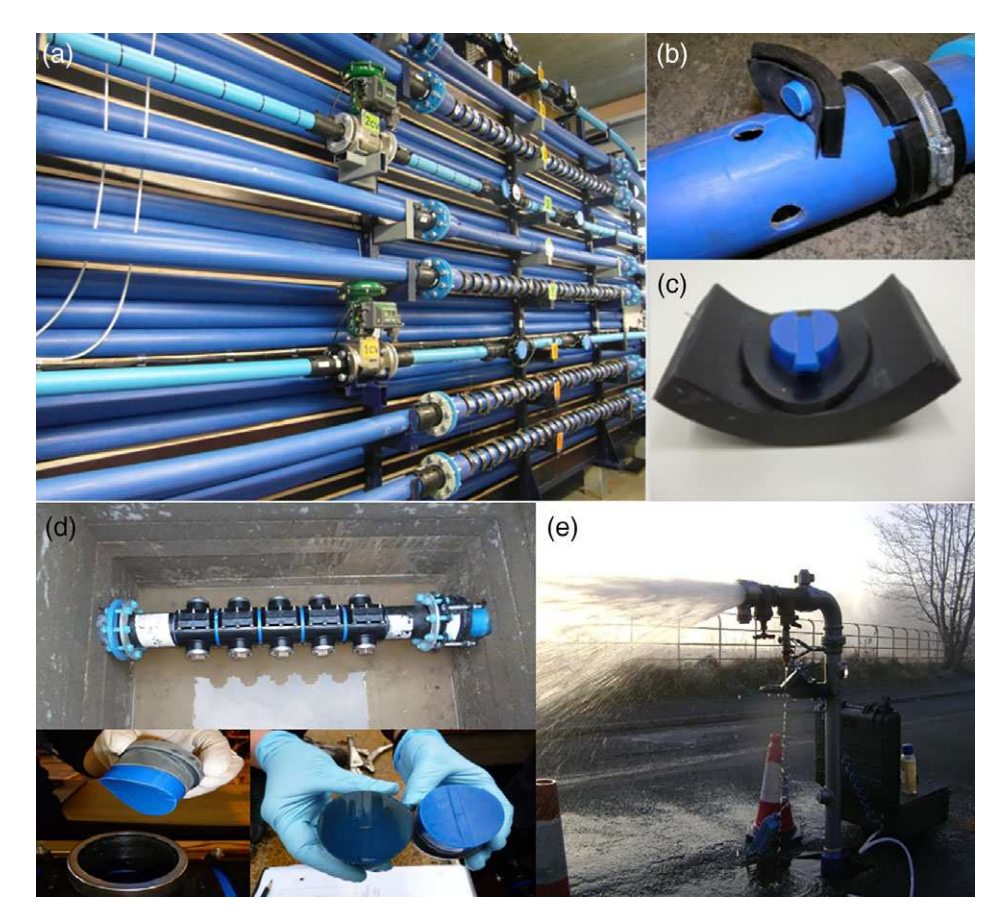
FIGURE 1 (a) Real-scale DWDS laboratory facility at Sheffield University, (b) PWG coupons are inserted along the pipe, (c) PWG coupons showing insert and outer part of the coupon. (d) Biofilm sampling devices used to sampling biofilm in situ during field work. (e) Flushing equipment used in real DWDS