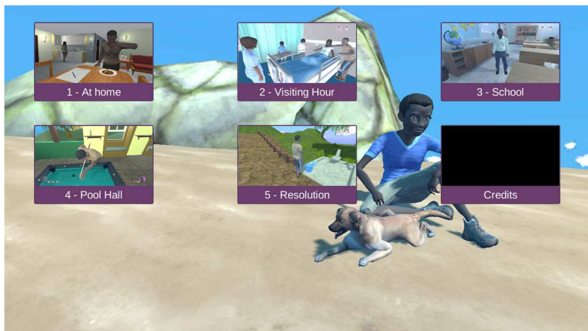
Figure 1. Screenshot showing the main character Jesse and 5 levels of the game.

An important element of Jesse's development has been socio-cultural sensitisation to Caribbean context, through consultation with groups of young people in Barbados, input from Caribbean experts and the inclusion of real world information, local dialects, voices and characterisations. The game consists of five levels (see Figure 1). Level 1 is an introduction to the main characters in the game, including the main player character - a young schoolboy named Jesse, Jesse's mother (Diana), and Diana's partner (Rondell) who is the IPV perpetrator. Level 2 takes place in hospital, where Diana was admitted after her partner had physically abused her. Level 3 is placed in Jesse's school. As Jesse's teacher (George), players must ask Jesse questions and attempt to discover why Jesse's behaviour and grades are suffering. Level 4 features Rondell with his best friend (Hayden) having a conversation about Rondell's violent behaviour toward Diana. In level 5, players are given a choice to determine the outcome of the story.