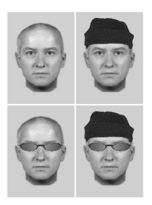
Fig. 3. Example composite constructed from memory by a participant in Experiment 3 of EastEnders' character Alfie Moon (played by actor Shane Richie), top left, and different representations, edited with selective concealments (woolly hat and sunglasses). Images were presented together as an array. In this example, the composite constructor initially saw a target photograph with inaccurate hair (a bald head in this case).