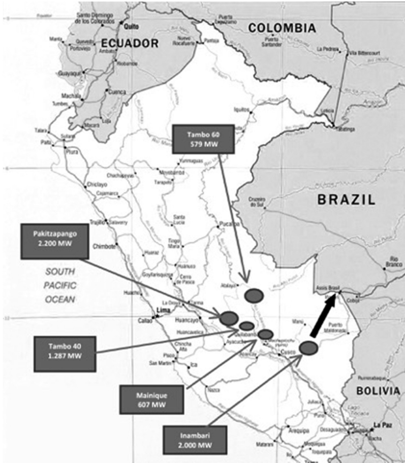
Figure 1 Location of Dams Proposed by Treaty.