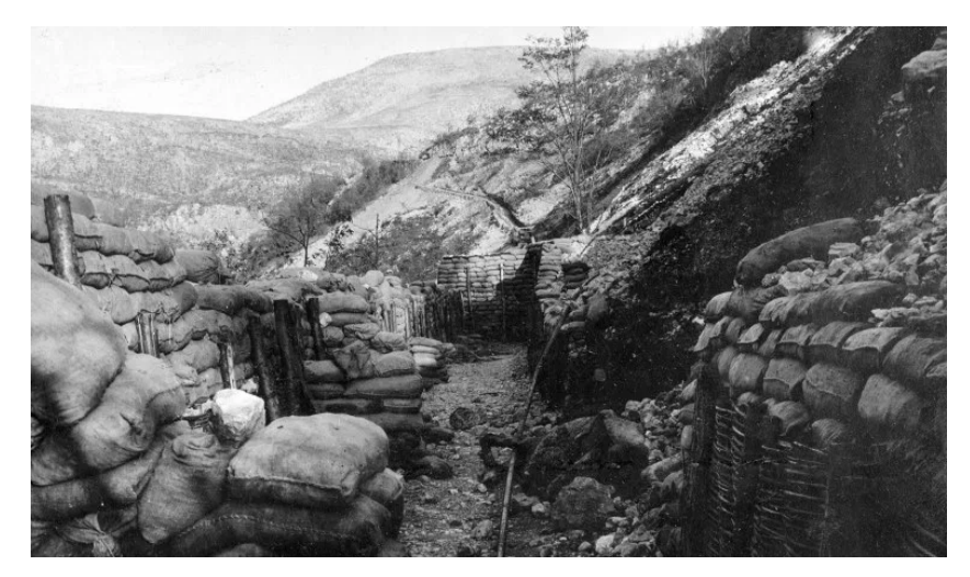
Trenches at Monte San Gabriele (Skabrijel) along the Italian front, 1917.

The moments of A Farewell to Arms that seem the most peaceful are those moments in the midst of war where through some momentary respite Frederic connects with nature: 'The earth of the dugout was warm and dry and I leant my shoulders back against the wall, sitting on the small of my back, and relaxed' (45). These moments are facilitated by landscapes which occupy the middle ground of the 'pastoral ideal' (Marx 255), set between the over-civilised nature of manicured gardens and the true wilderness of the mountains: