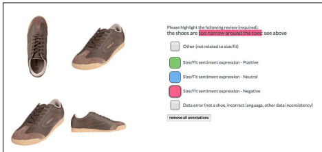
Figure 2: Labeling interface.