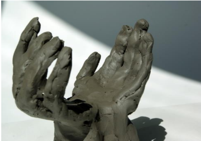
Figure 3 Feeling Uplifted

In contrast to Pierrot, Demi used clay to reveal how she feels when she does have the opportunity to build relationships with the families she is working with (see Figure 3).