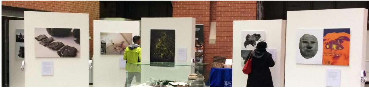
Figure 1: The exhibition