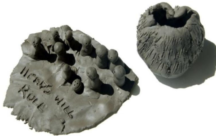
Figure 4 Heads will roll

Five of our participants had strong responses to the formal organisational processes and systems that were in place in their organisation. The post-qualification experience amongst these participants ranged from 6 to 20 years. In some cases, they used their artwork to make connections between the formal processes and the wider context of social work practice. In this next piece of artwork, Frederica used two pieces of clay work to express how these factors affected her (see Figure 4).