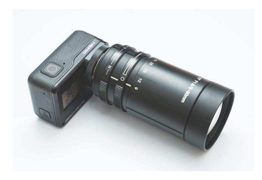
Fig 1. BackBone Ribcage H5PRO with attached 9-90mm Kowa lens