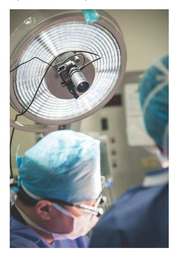
Fig 2. Photograph portraying fixation to theatre light handle using the GoPro handlebar mount