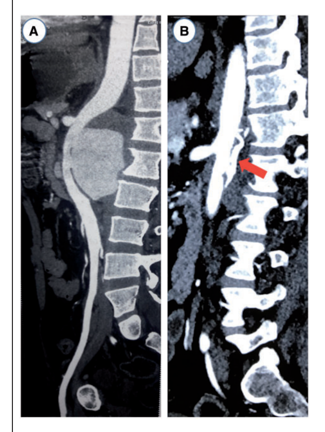
Fig. 1 (A) CT angiogram (sagittal view) of abdominal vessels showing a large ( 7.3 \text{ cm} \times 5.4 \text{ cm} \times 7.9 \text{ cm} ) pseudoaneurysm arising from the posterior wall of the aorta at the level of origin of the right renal artery, with self-contained rupture. (B) Postoperative CT angiogram (sagittal view) showing intact repair. Radio-opaque area behind repaired rent is Teflon felt (polytetrafluoroethylene material) used for reinforcement of repair (arrow).

dose administration. Abstracts of the Annual Meeting of the Population Approach Group in Europe, PAGE 26, 2017, Abstr 7284. https://www.page-meeting.org/default.asp? abstract=7284 (26 November 2018, date last accessed).