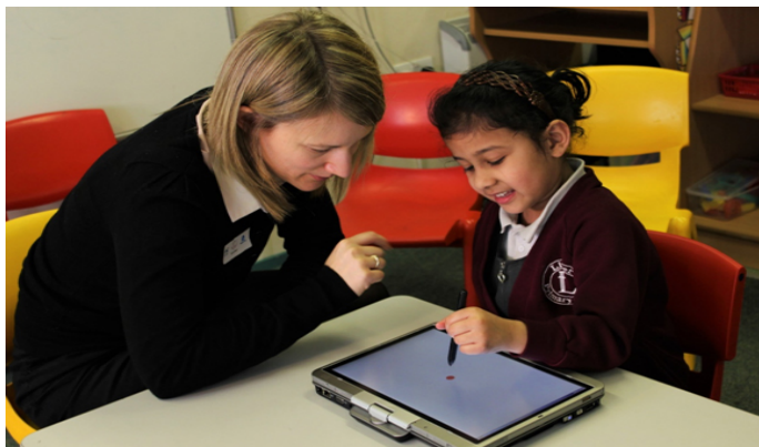
Figure 3: Kinelab is currently being used to measure the manual dexterity abilities of school children in Bradford, UK