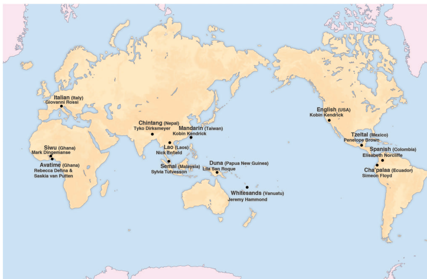
Figure 1: Languages featured in this study, with names of the contributing researchers. The corresponding database was first reported in San Roque et al. (2015).

The investigators named in Figure 1 provided transcripts and coding for each language. To do so, they drew on long-term fieldwork with the relevant community, having worked in collaboration with (other) native speakers to record, transcribe, and translate conversational material. This is time-consuming and challenging work, in many cases made more so by a dearth of prior language description and difficult field conditions. Such difficulties, indeed, go partway to explaining the low representation of conversational corpora in cross-linguistic study (cf. Floyd et al. in press).