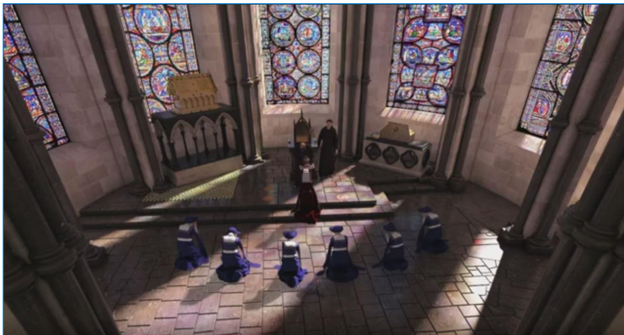
Figure 3 The Countess of Kent in the Corona Chapel.