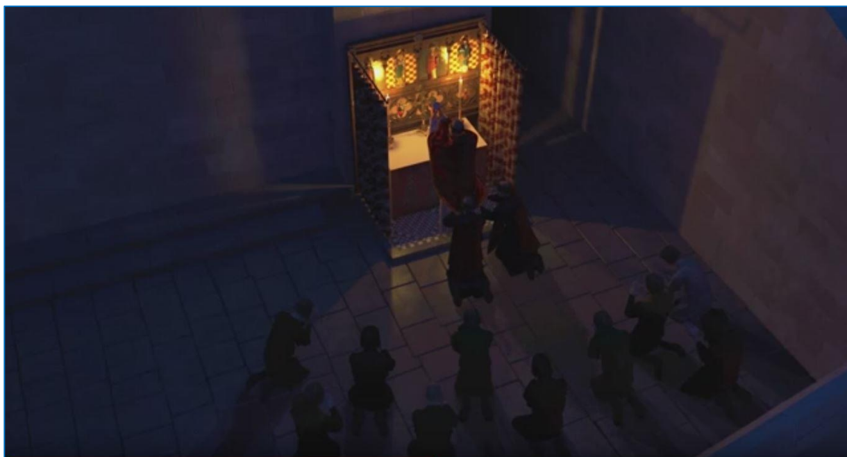
Figure 4 The Mass at the Martyrdom altar on 29 th December.