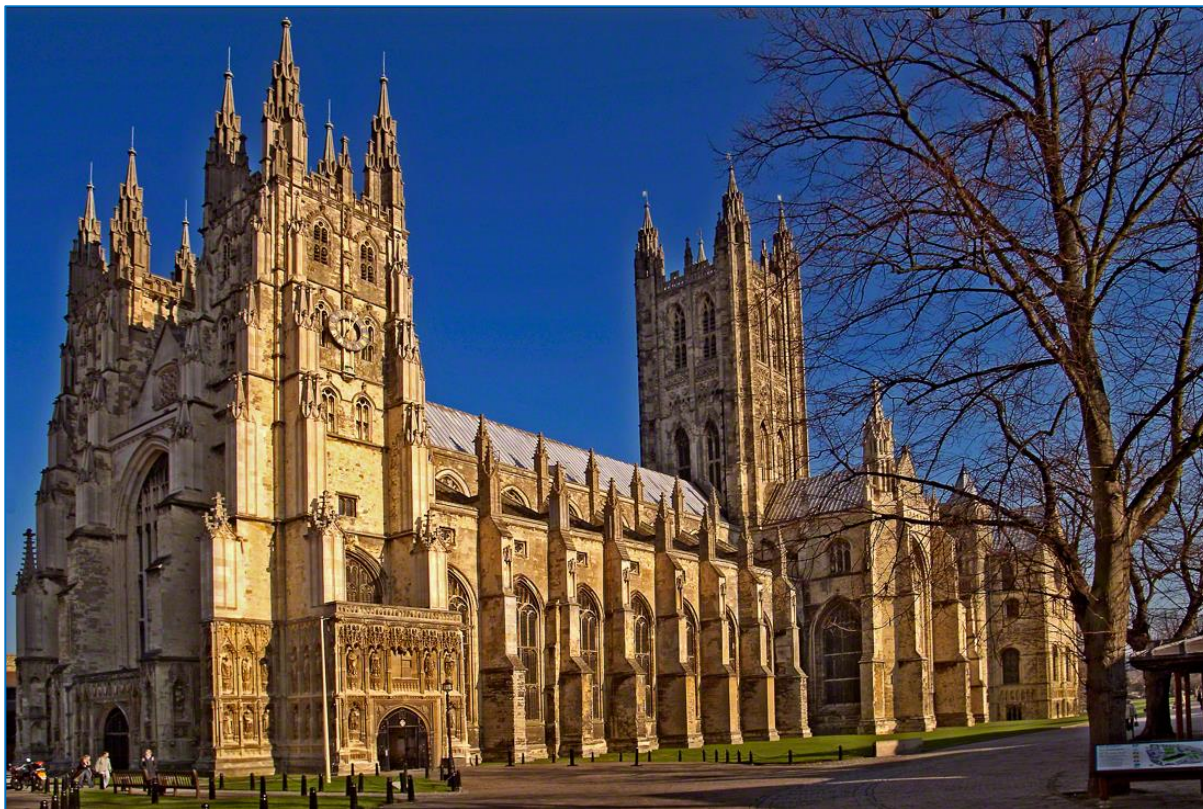
Figure 1 Canterbury Cathedral.