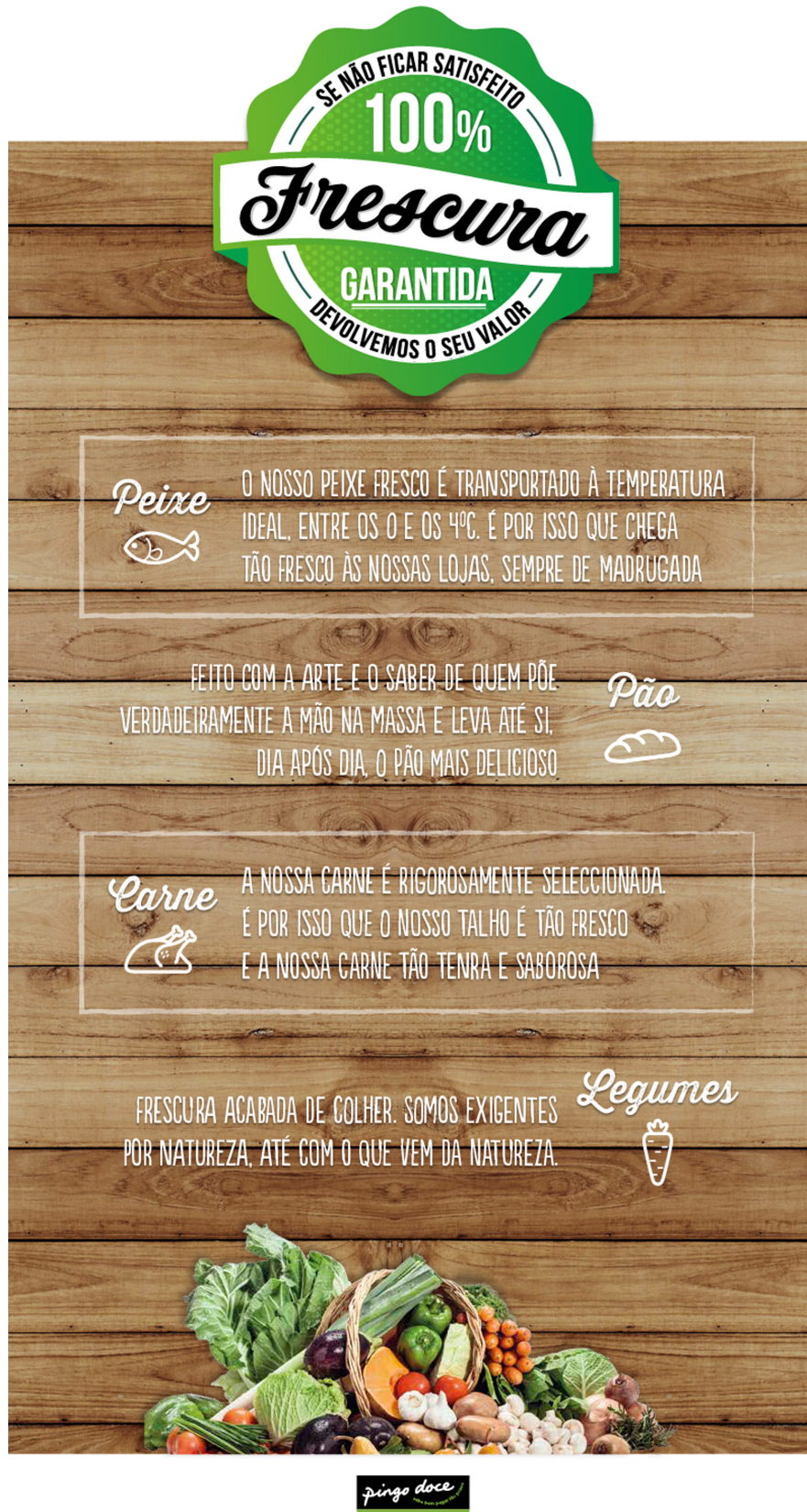
FIGURE 1 Advertisement for Pingo Doce's "Frescura" range (reproduced with permission).