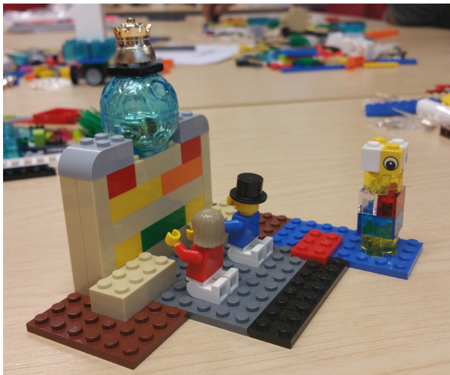
Figure 2. Economic incentives.

“[P]eople [are] always looking forward and looking up to what is the financial ideal, what is the market, or what can we patent, what can we get money for? Whereas the strange animal that is academic and socially valuable research is left in the corner”.