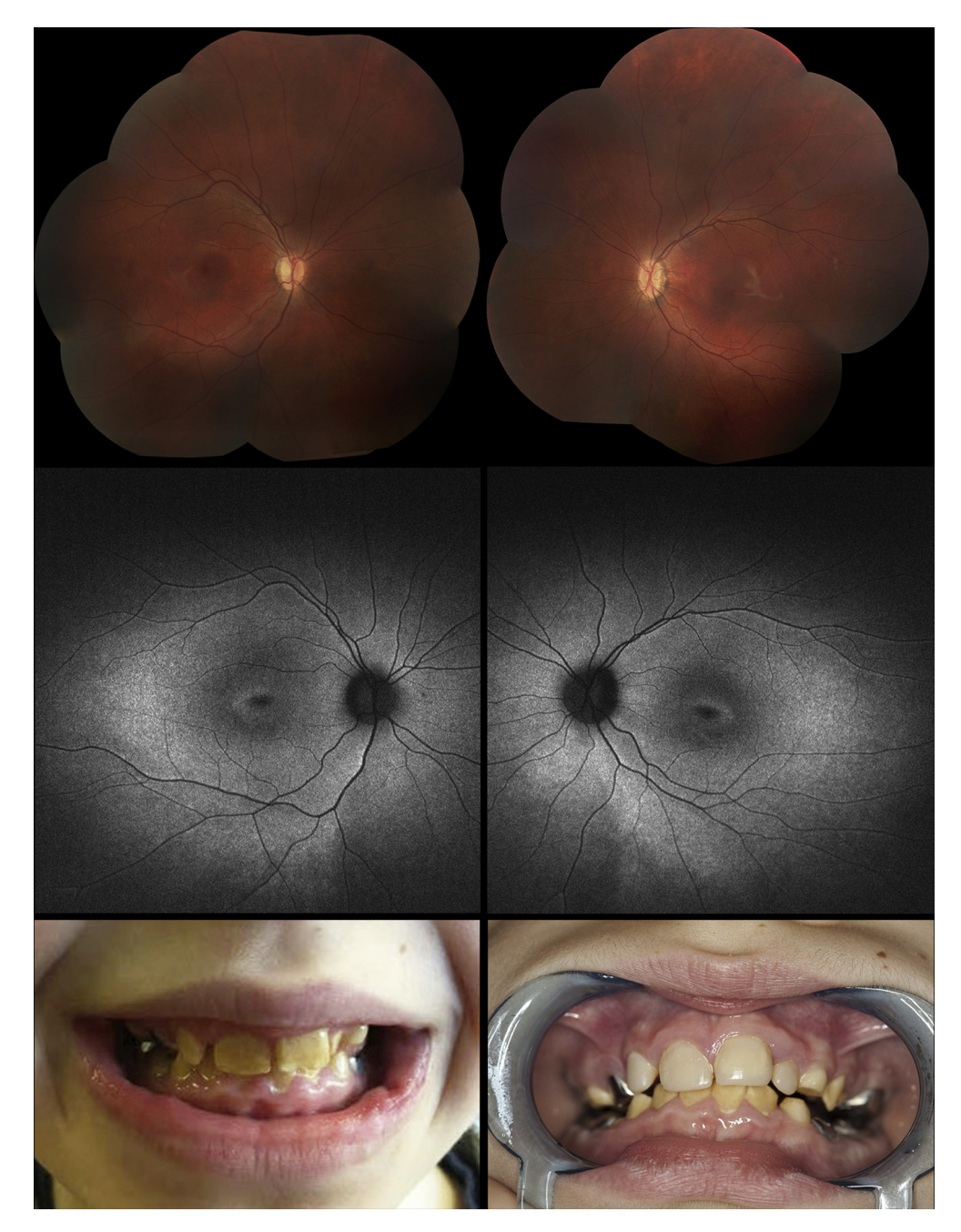
FIGURE 2. Images demonstrating the phenotype of Patient 5. Fundus appearances at presentation showing tilted optic discs, loss of the foveal light reflex, and mild vascular attenuation in the right eye (Top left) and left eye (Top right). Fundus autofluorescence imaging 3 years later showed generalized hyperautofluorescence in the posterior pole as well as a ring of hyperautofluorescence around the fovea in both the right (Middle left) and left (Middle right) eyes. (Bottom left) Teeth at presentation, demonstrating enamel hypoplasia and the presence of crowns. (Bottom right) Teeth 3 years later, after upper teeth had been resurfaced.

to the DA6.0 response. Cone-driven responses (both LA6.0 and 30 Hz flicker) were severely reduced in each eye.